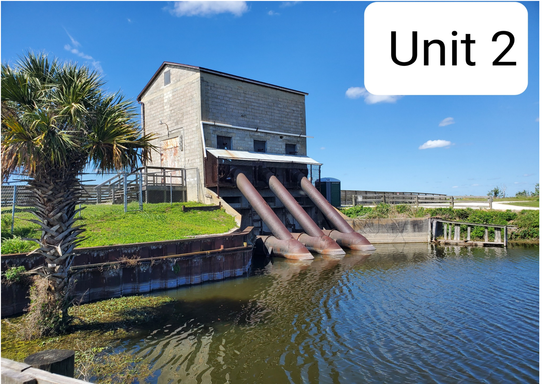
Figure 3 - Looking West at Pump Station