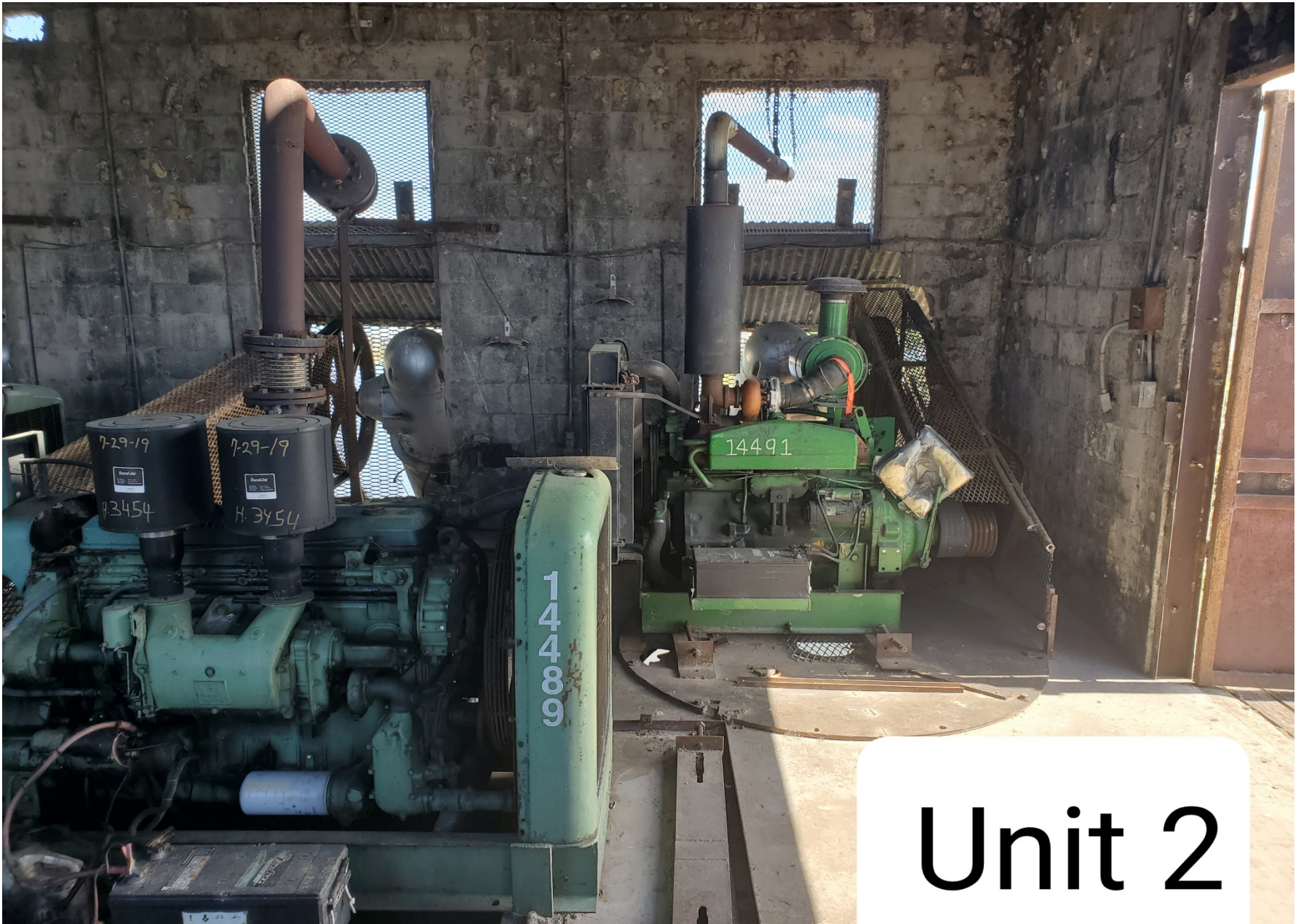
Figure 1 - Center and South Pump