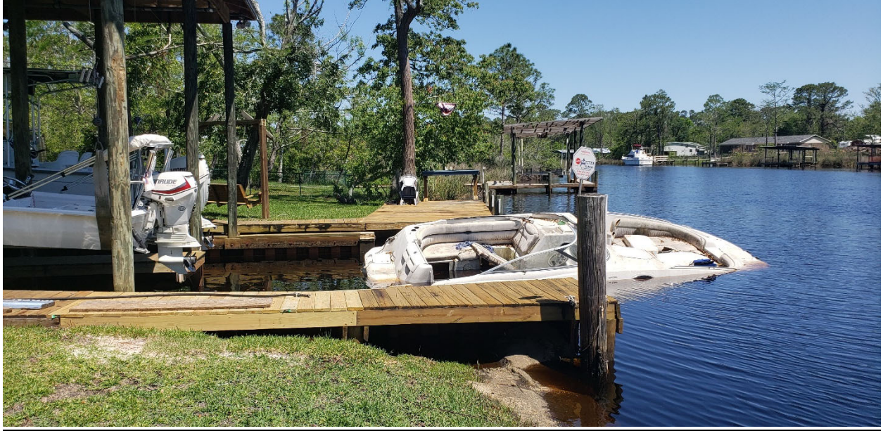
Vessel blocking dock/sunk