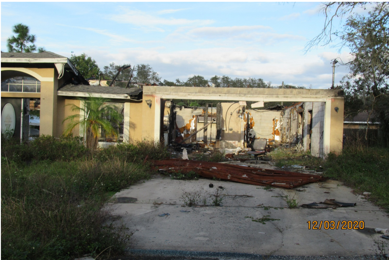
2376 N Esplanade Road, Avon Park, FL 33825