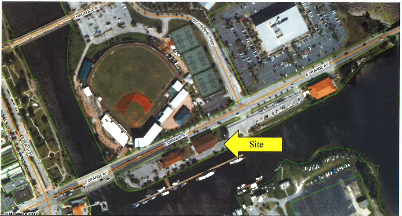
East Orange Avenue Daytona Beach, Florida