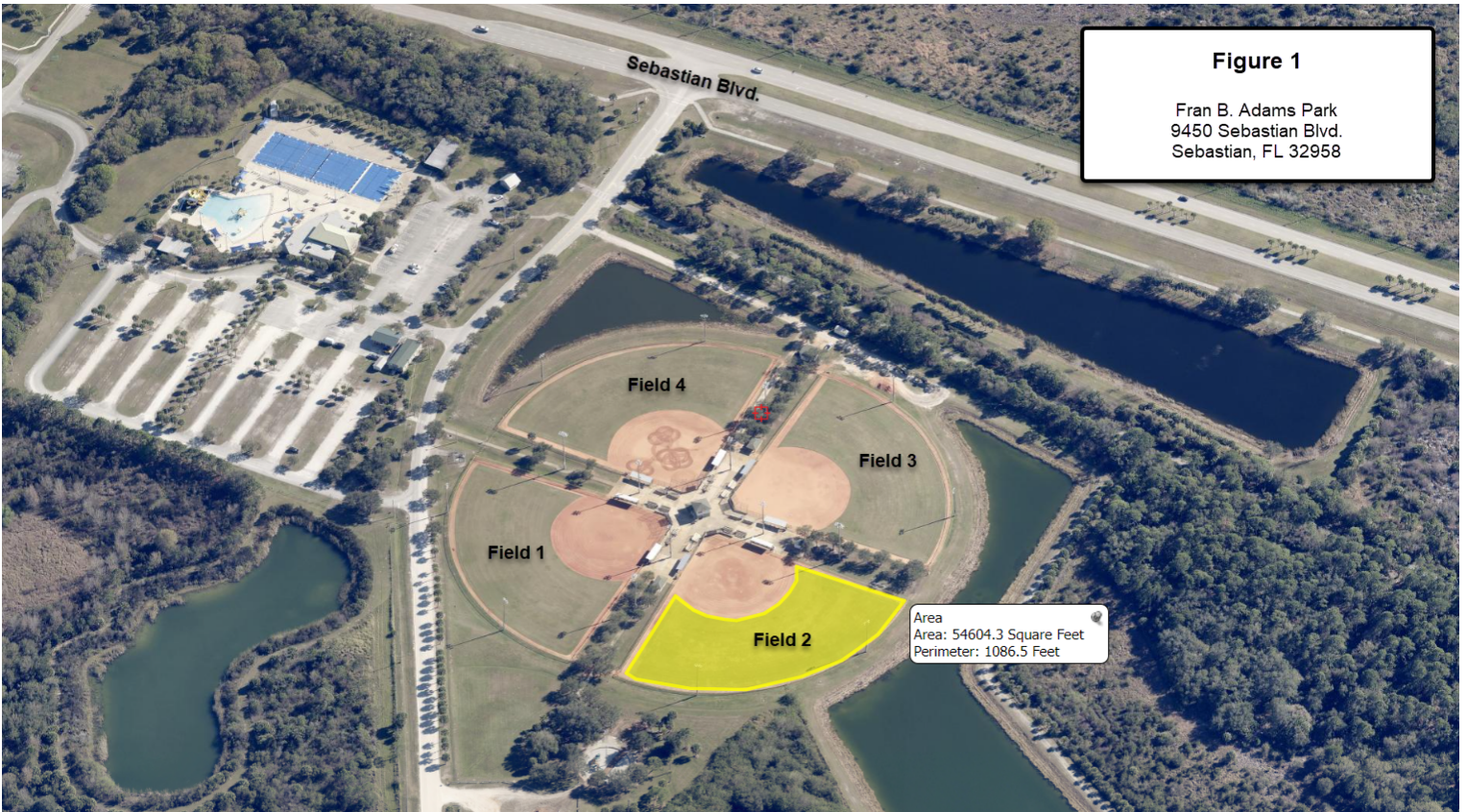
Figure 1 Fran B. Adams Park 9450 Sebastian Blvd. Sebastian, FL 32958