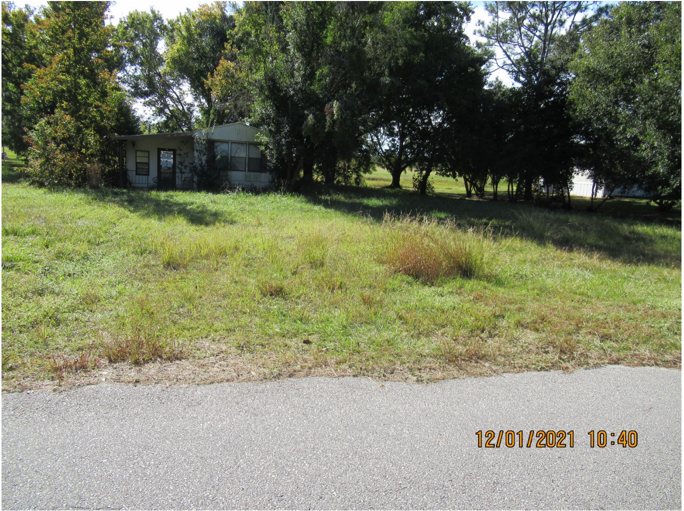
116 Pine Tree Drive, Lake Placid, Florida 33852 Parcel: C-10-36-29-010-0630-0050