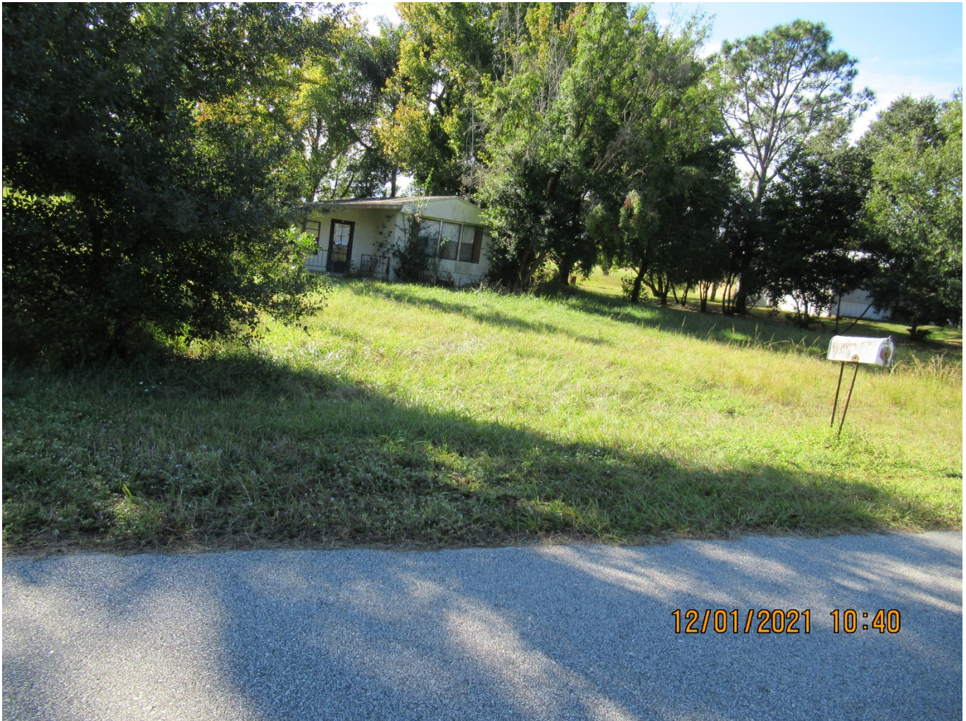
116 Pine Tree Drive, Lake Placid, Florida 33852 Parcel: C-10-36-29-010-0630-0050