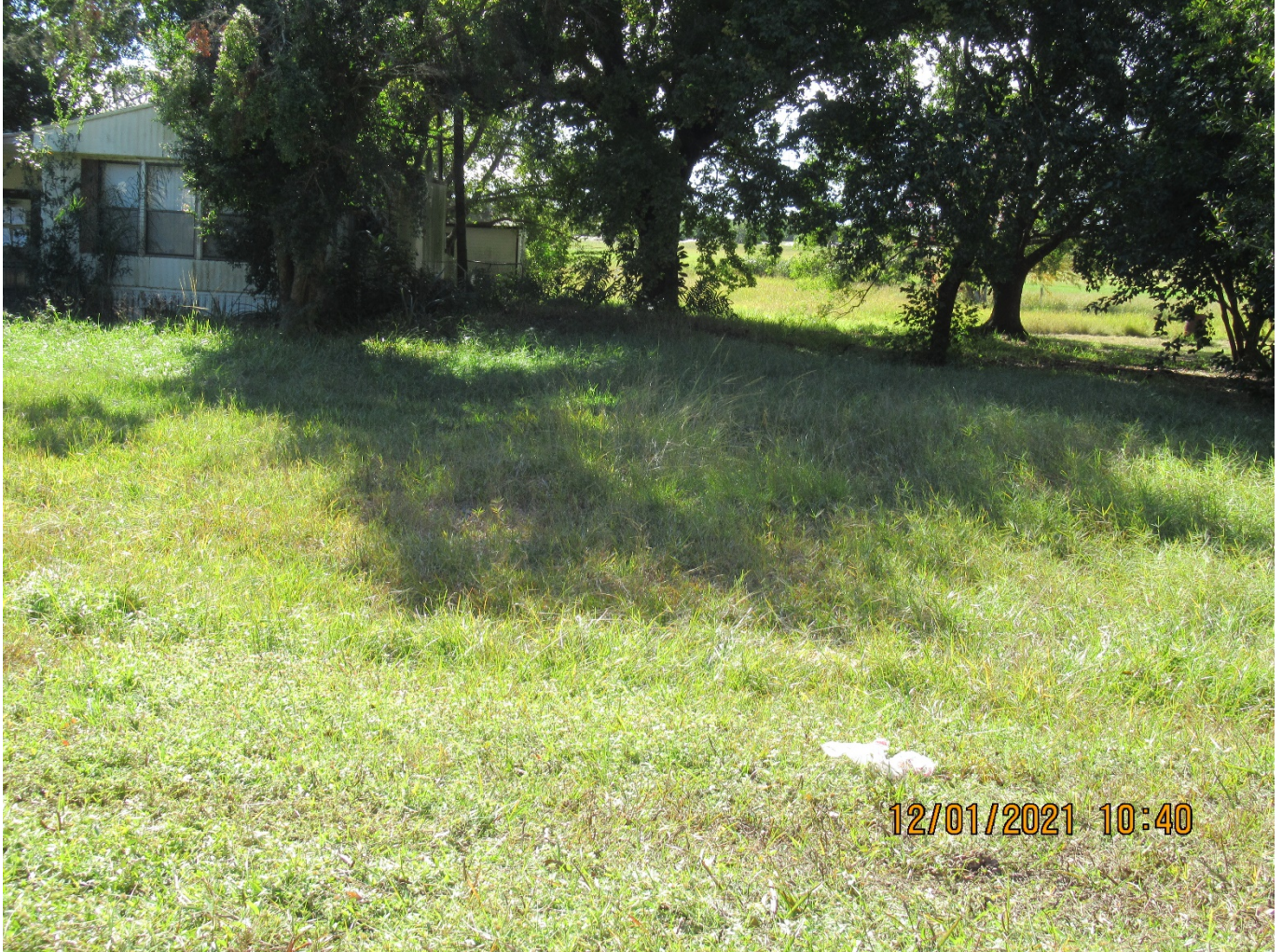
116 Pine Tree Drive, Lake Placid, Florida 33852 Parcel: C-10-36-29-010-0630-0050