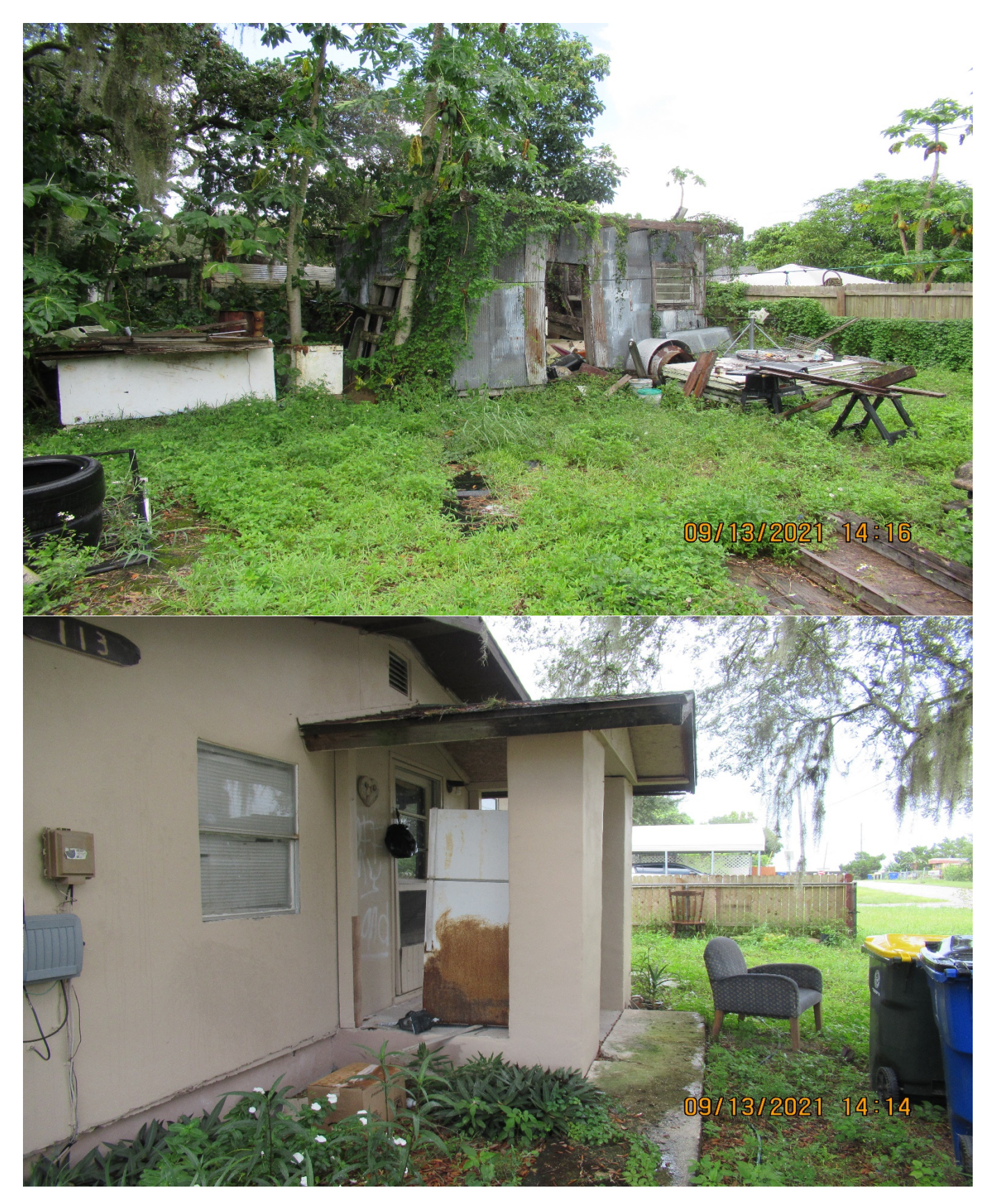
113 Lawrence Avenue, Sebring, Florida 33870