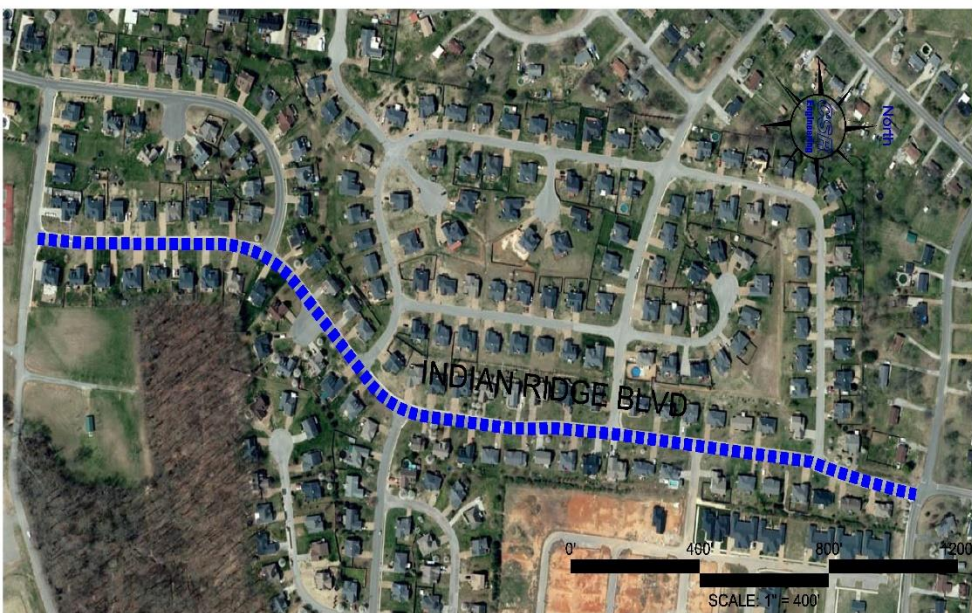
INDIAN RIDGE BLVD.