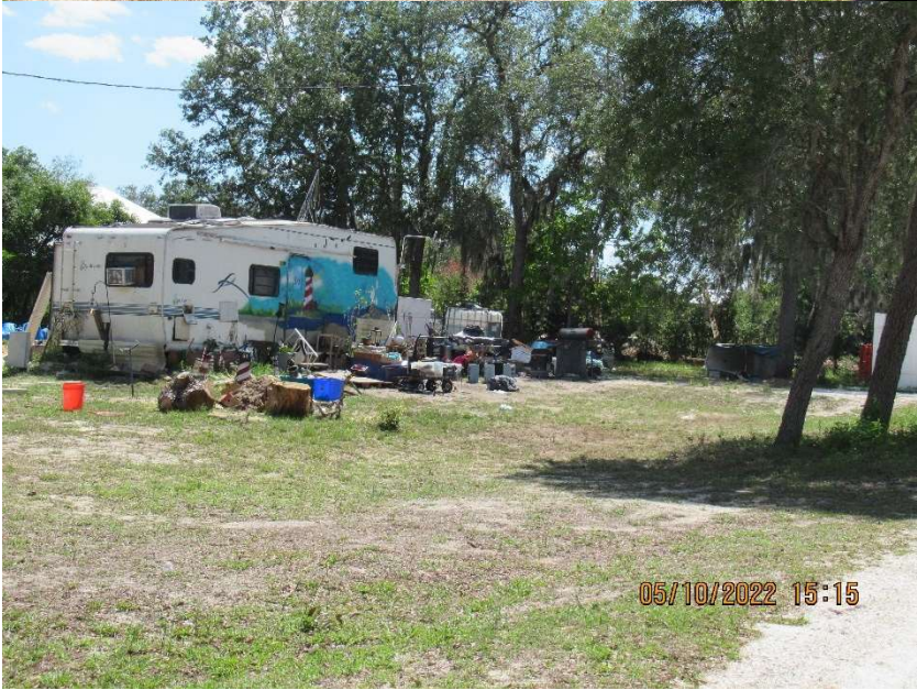
FWQ 22-028-LKD Property Clean-up: 6080 Highland Street