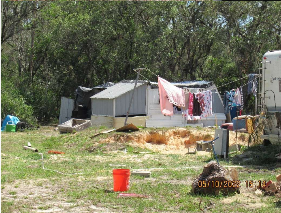
FWQ 22-028-LKD Property Clean-up: 6080 Highland Street