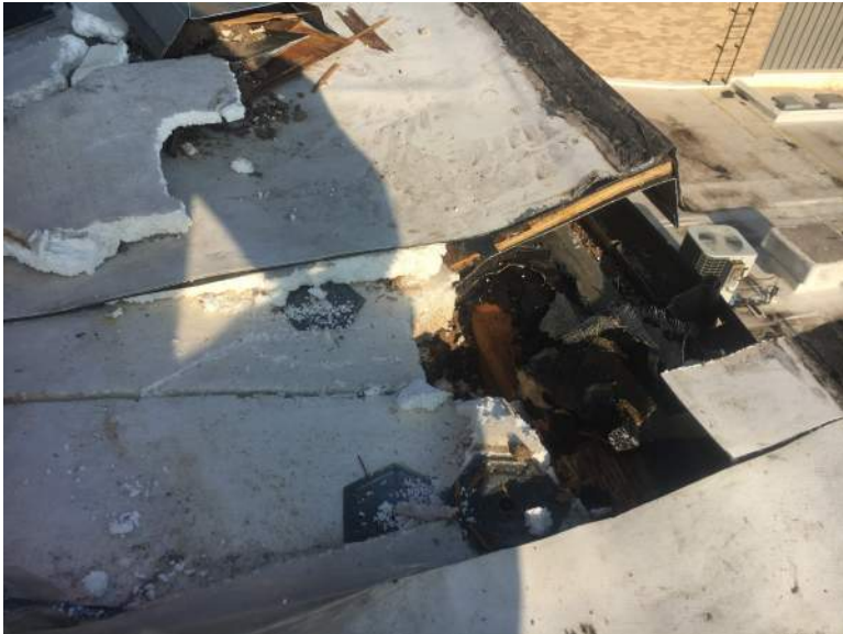
IMAGE OF EXISTING EDGE CONDITION