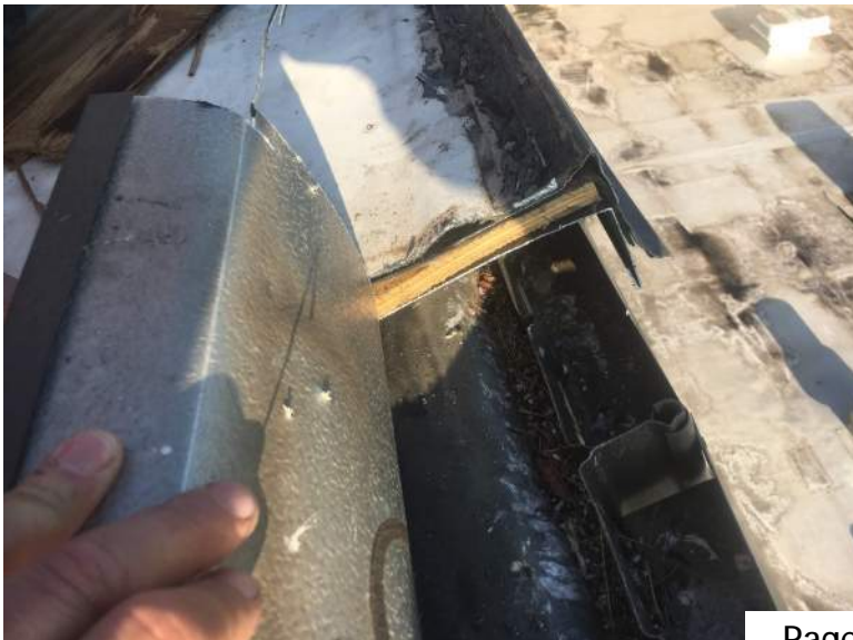
IMAGE OF EXISTING EDGE CONDITION