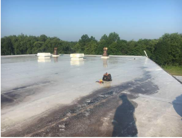
IMAGE OF EXISTING ROOF MEMBRANE