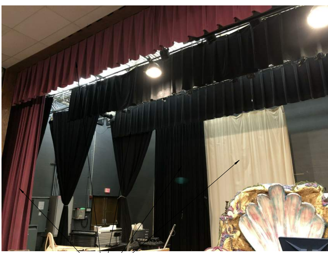
PROVIDE (N) STAGE CURTAINS PER SPECIFICATIONS. REF. BID ALTERNATE #11