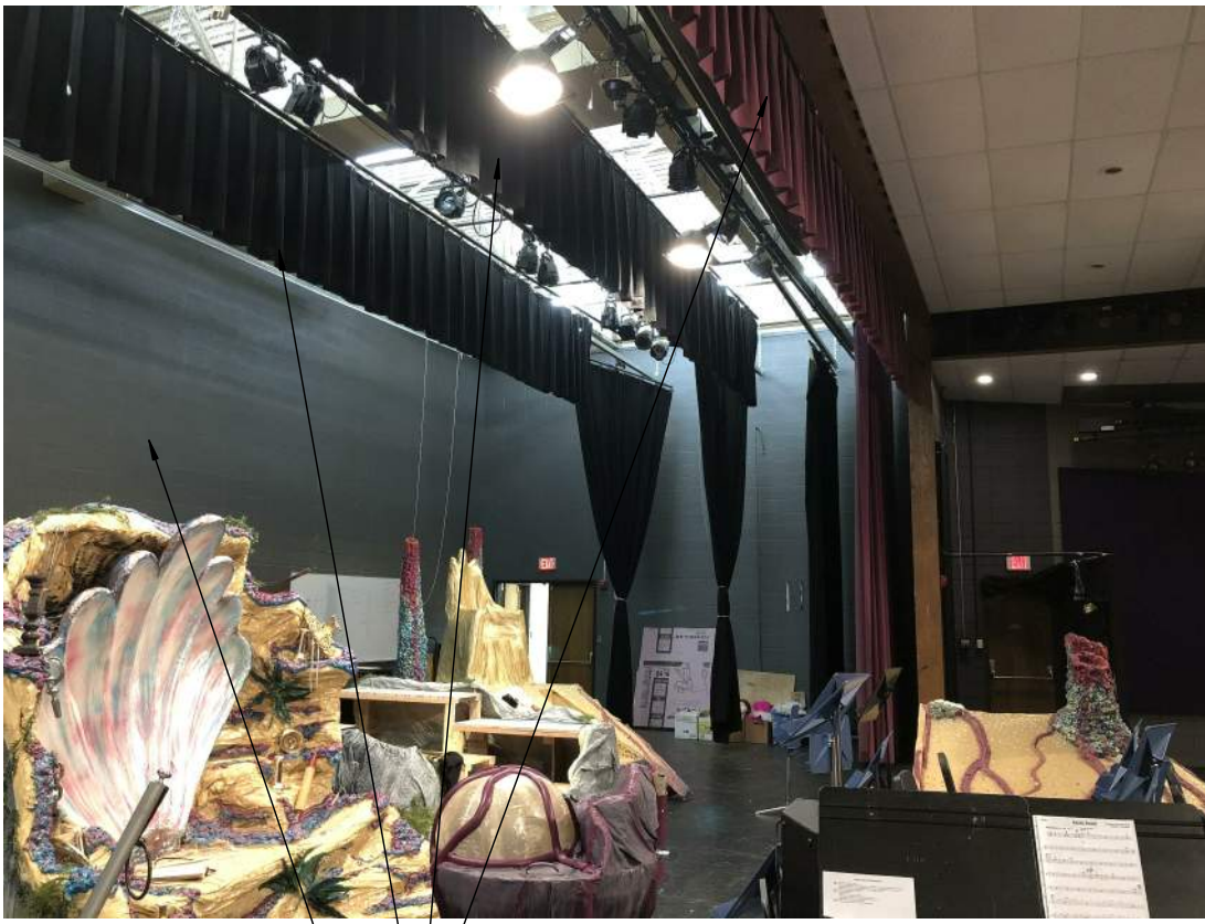
PROVIDE (N) STAGE CURTAINS THROUGHOUT. REF. SPECIFICATIONS & BID ALTERNATE #11. WALL TO BE DEMOD PER AD1.4