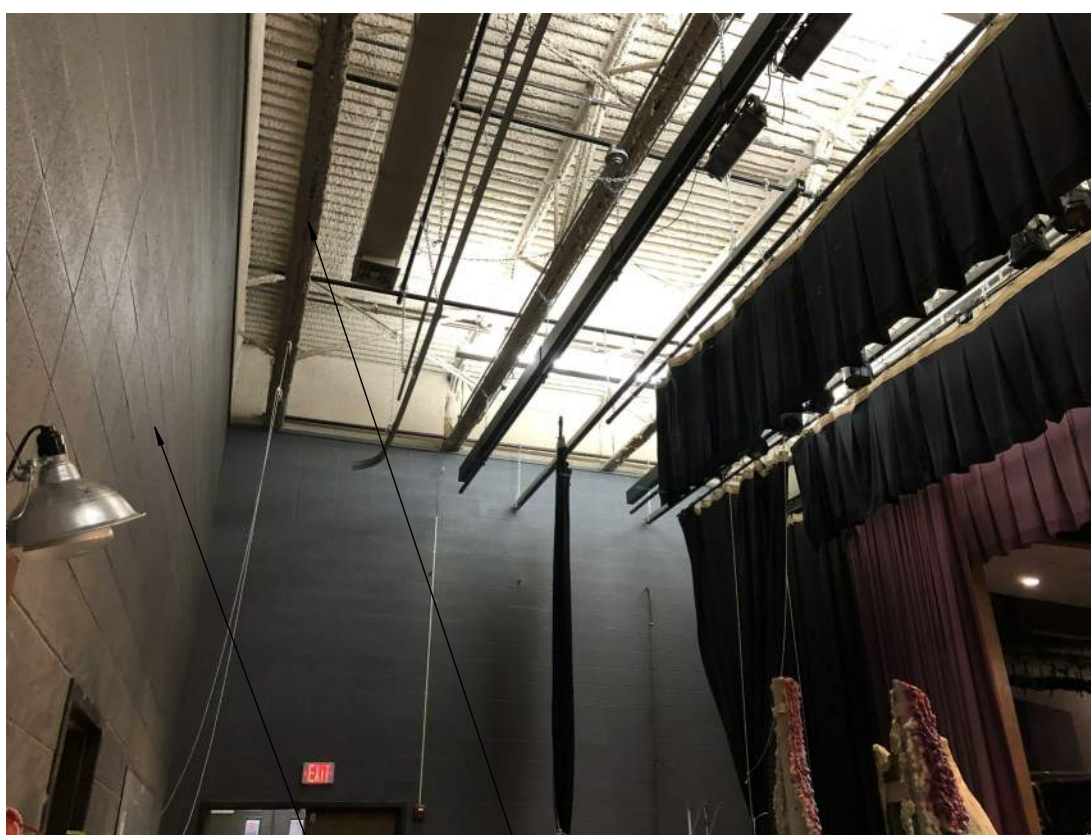
RELOCATE (E) TRACK PER AS.4. WALL TO BE DEMOD PER AD1.4