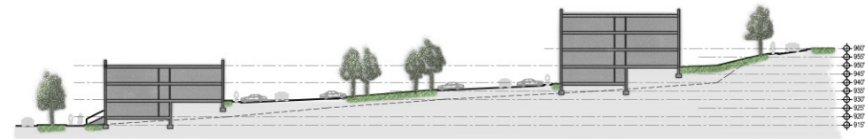
SITE SECTION 'A' SCALE: 1" = 100'