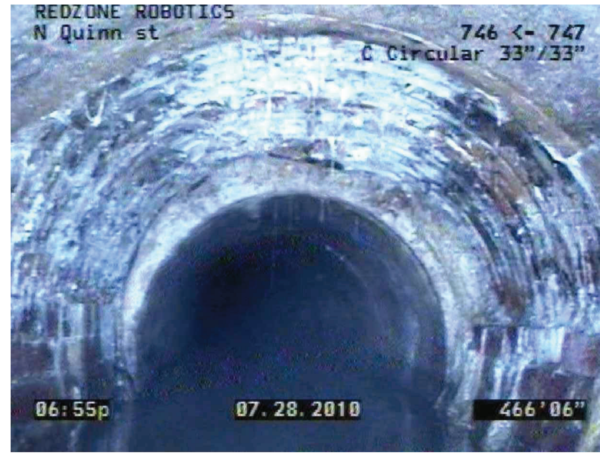
PHOTO 6 CORRUGATED METAL ON TOP OF MH 747