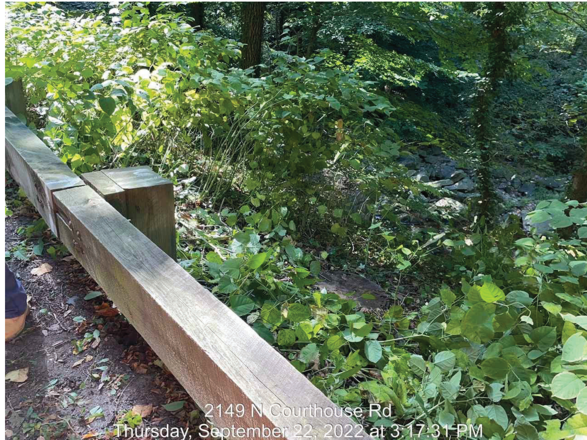
PHOTO 2 MANHOLES 749