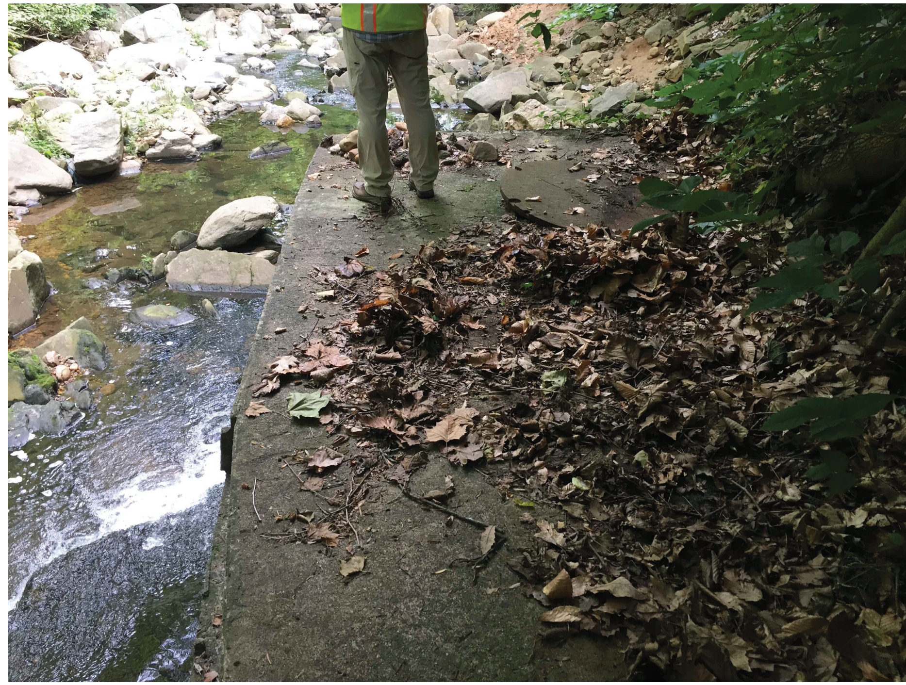
PHOTO 1 MANHOLES 750