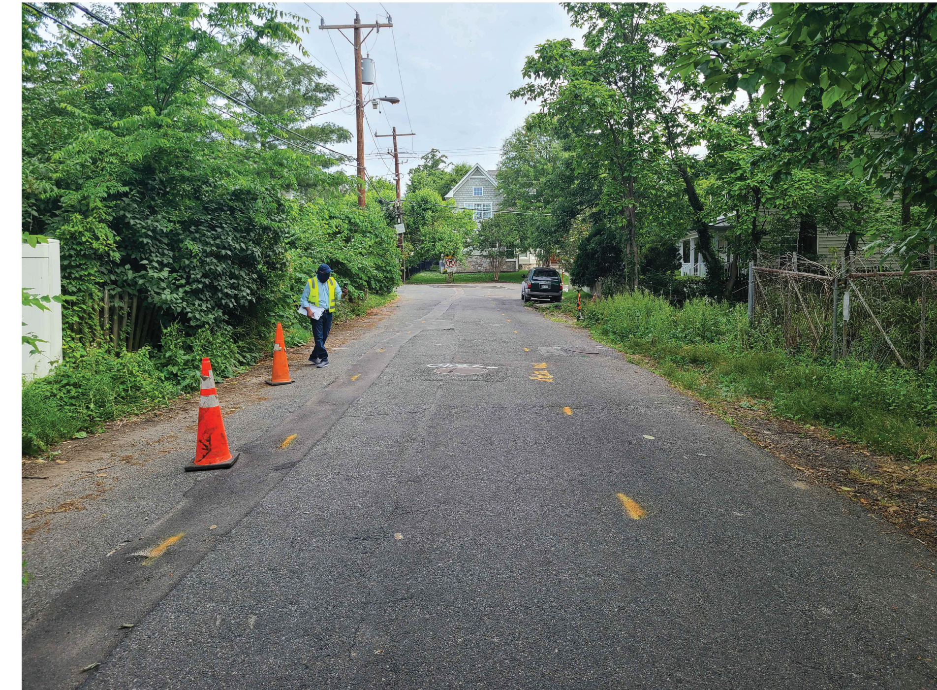
PHOTO 7 MANHOLE 746