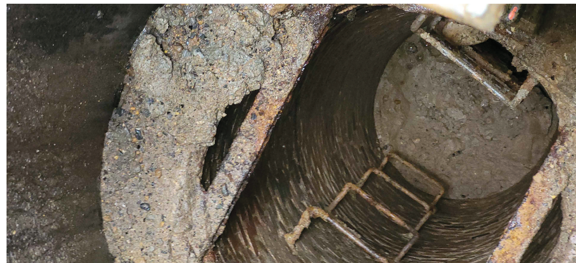
PHOTO 5 MANHOLE 747