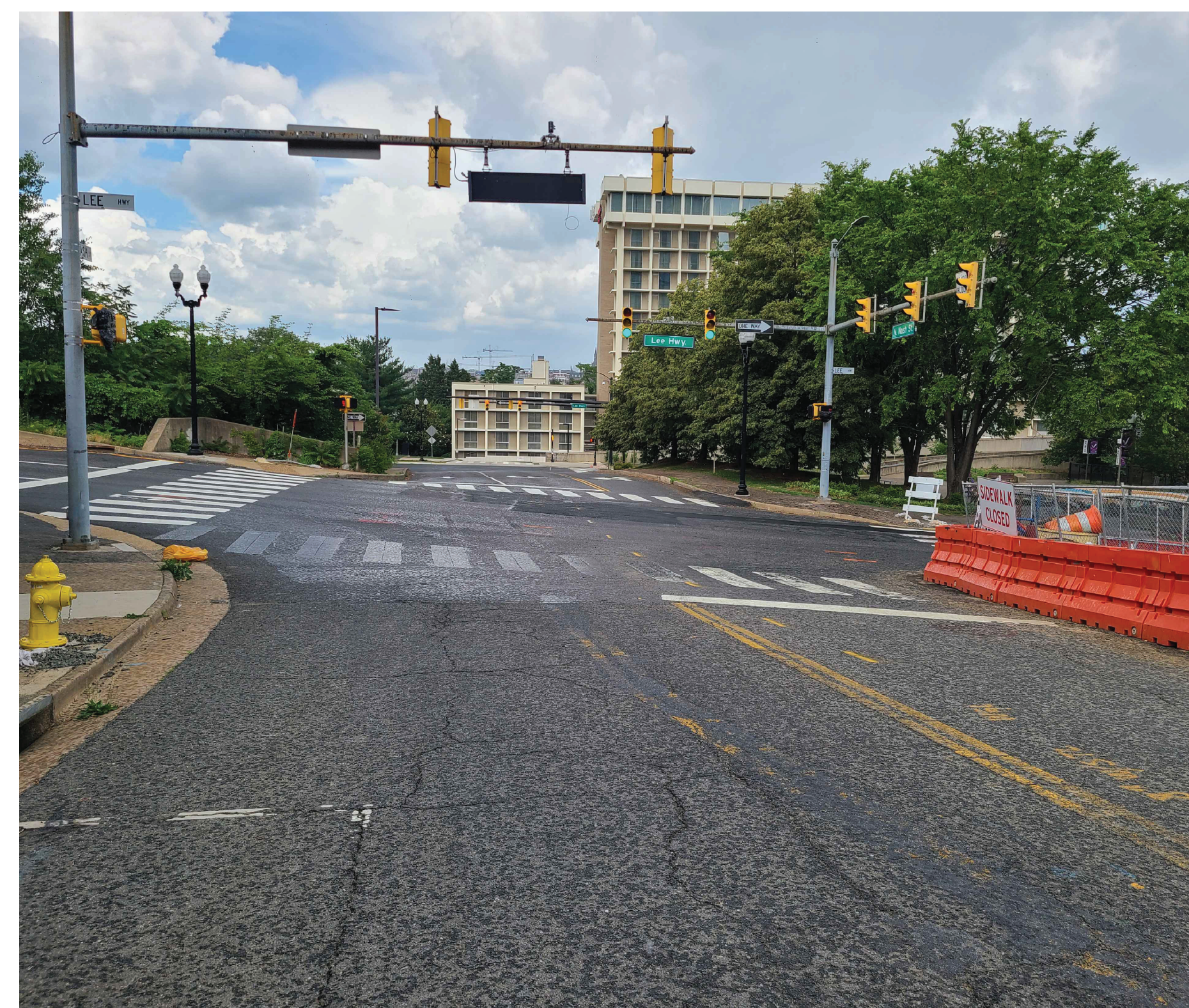
PHOTO 5 TERMINAL MANHOLE AT N. NASH ST.