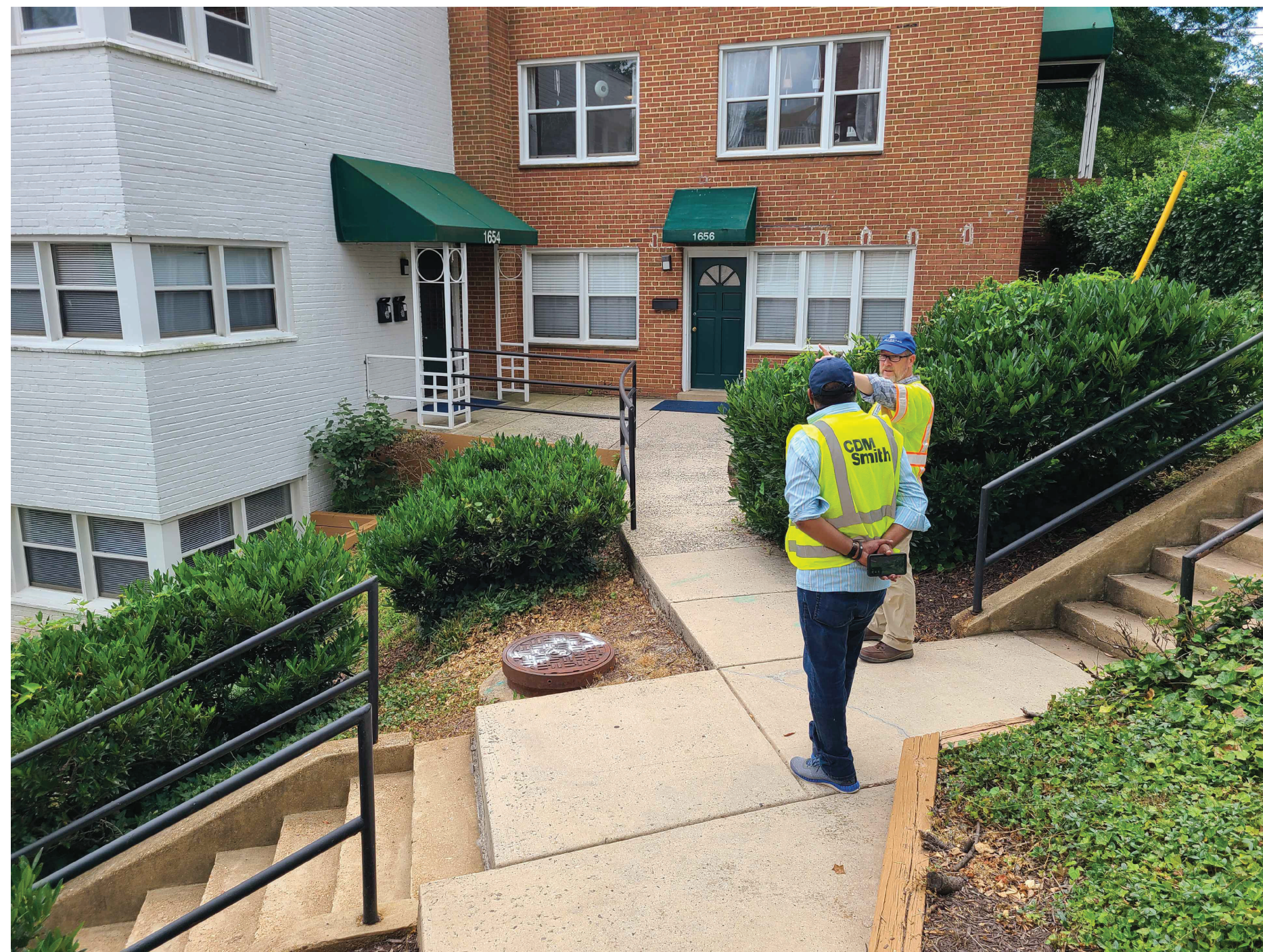
PHOTO 1 MANHOLES 745