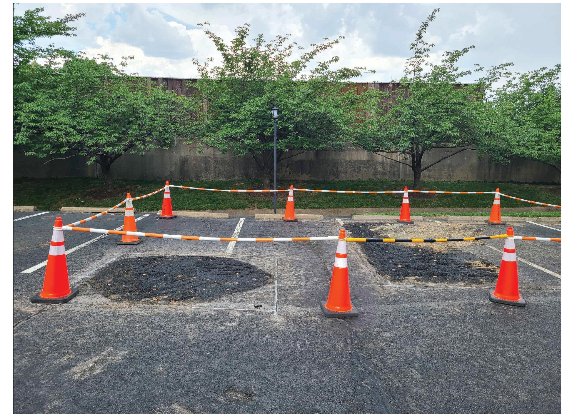
PHOTO 3 MANHOLES 741