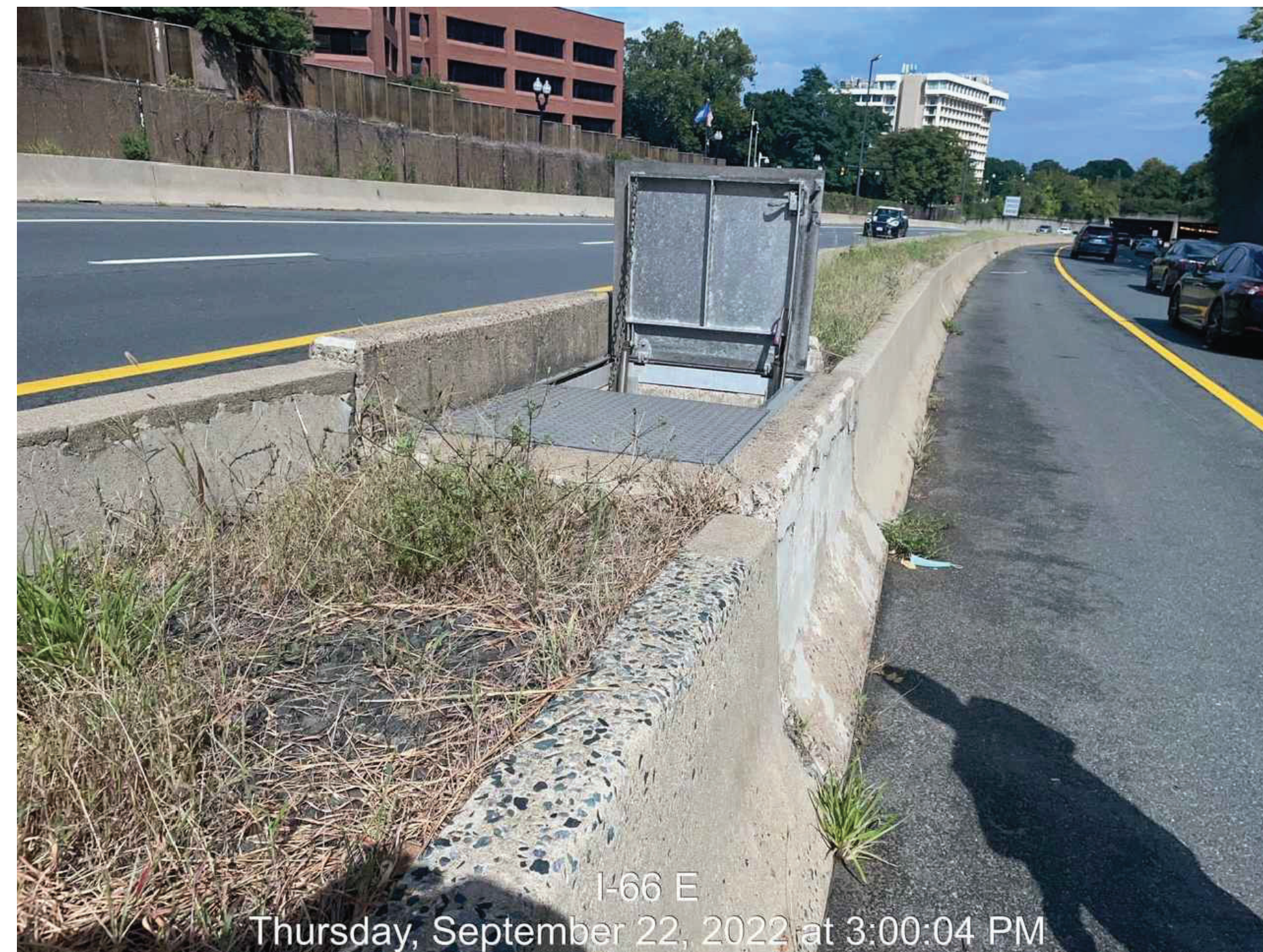
PHOTO 2 MANHOLES 742