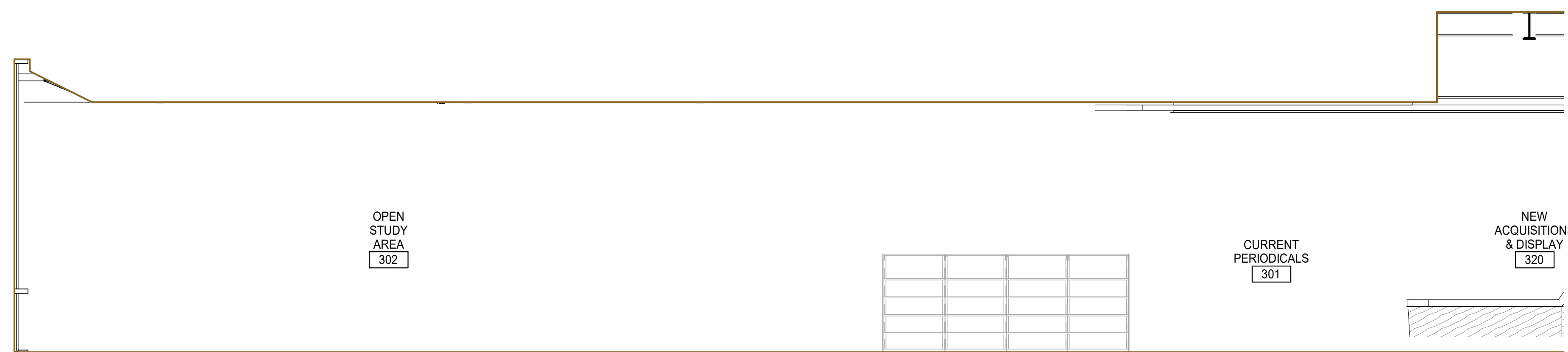
4 L3 - LIBRARY PERIODICALS SOFFIT ELEVATION 1/4" = 1'-0"