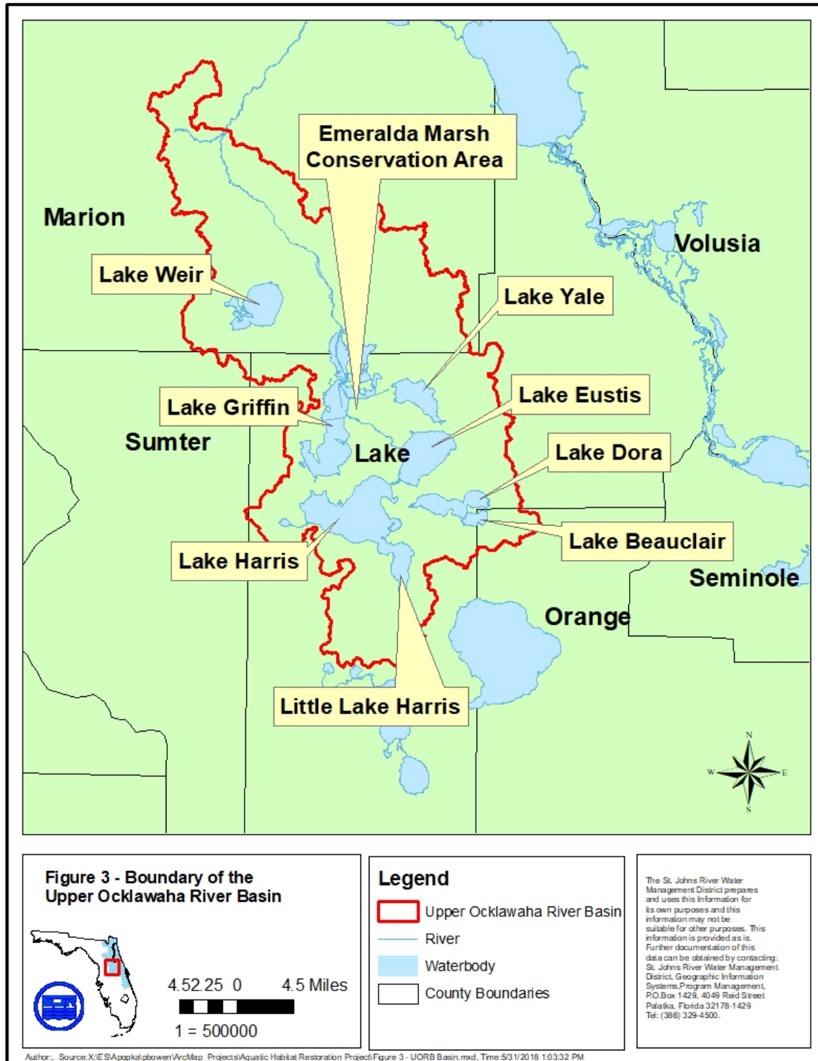
Figure 3. Boundary of the Upper Ocklawaha River Basin. Wild harvested floating-leaved emergent plants may be harvested either inside or outside the basin or from Area 2 at Emeraldal Marsh Conservation Area which is owned by the District.