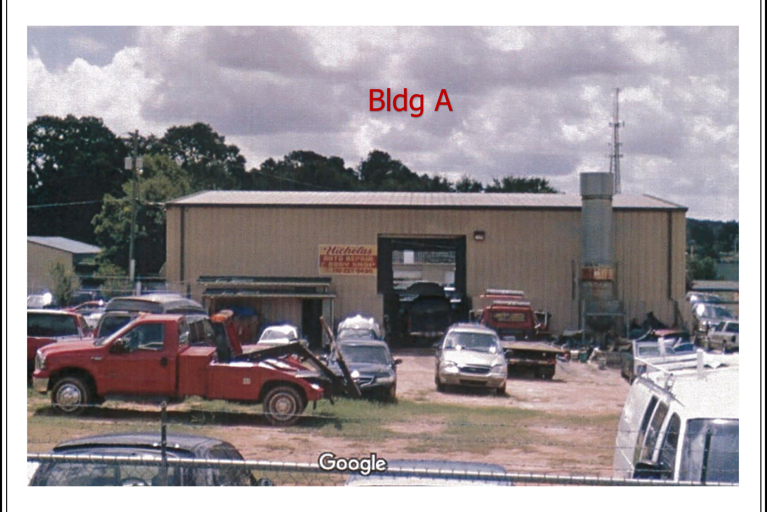
Back of Building A