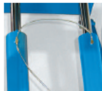
▶ MSL Cylinder w/Clear Plastic Return Lines