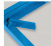
▶ MSL Swing Arm Safety Bar

Phone: 800-843-3625 • Fax: 630-584-9405 • www.advancelifts.com