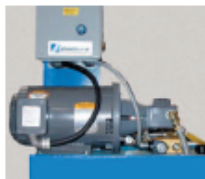
▶ Power Unit w/Controller