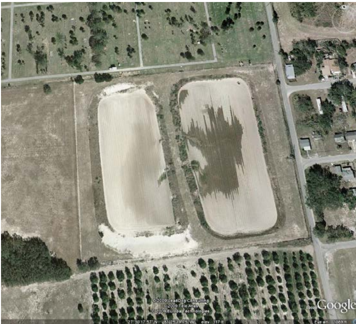
Western Blvd Facility – Corner of Thunderbird Road & Cougar GPS: 27d 29' 47" N & 81d 30' 49" W