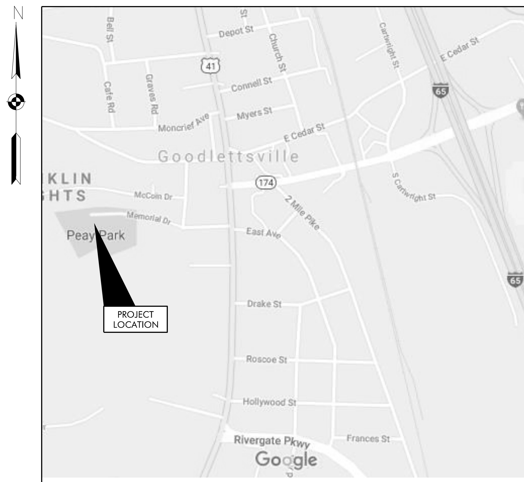
VICINITY MAP SCALE: NONE

200 MEMORIAL DRIVE GOODLETTSVILLE, DAVIDSON COUNTY, TENNESSEE