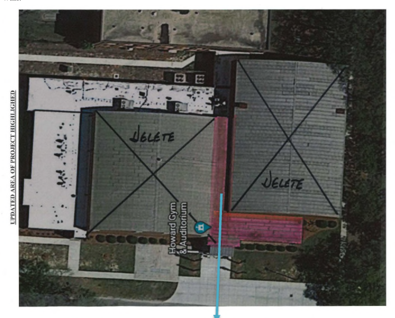
brick wall where the corridor roof joins the Auditorium roof

1) With the apparent source of the leaks having been more specifically identified, the Department will reduce the scope of the project to concentrate on the flat center and front corridor roofs, and will NOT include either the arched gymnasium roof, nor the arched auditorium roof. See the REVISED Project Area Below with the highlighted colored area. As discussed in the prebid, the brick wall where the corridor roof joins the Auditorium roof will be treated with a fully adhered membrane as an if it were part of the roof structure. See the attached photos in Exhibit A for illustration of this wall.