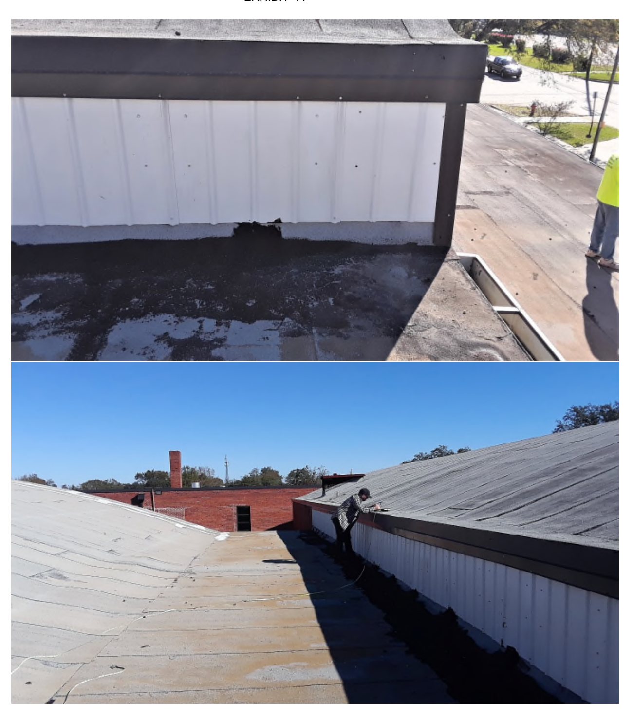
Vertical wall to receive fully adhered membrane treatment.