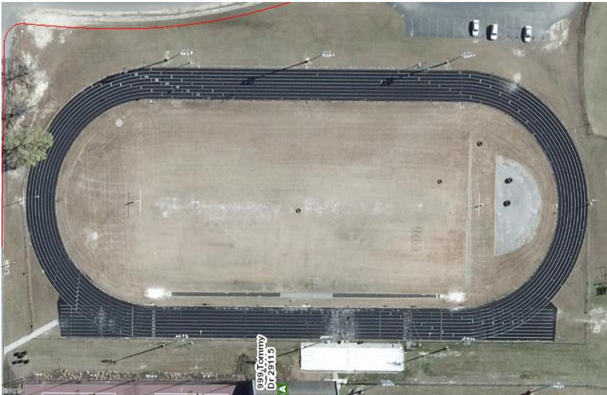
Lake Marion High 3656 Tee Vee Road Santee, SC 29142