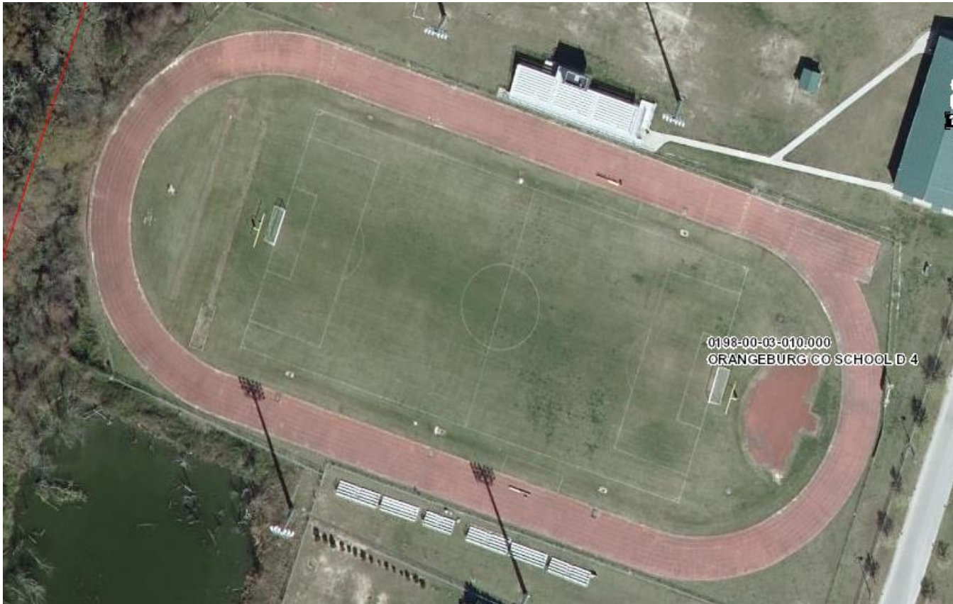
Edisto High School 500 RM Foster Drive Cordova, SC 29039