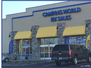
Row 2 (left to right): Planet Fitness, B & B Theatre and Premier Dental at the Wentzville Bluffs; Camping World at Interstate 70/Hwy A.