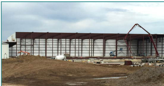
Above: 100,000 square foot expansion at etrailer, located at 1507 E. Highway A.