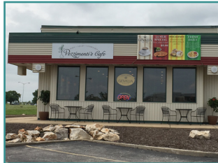
Row 1 (left to right): Yo Salsa!, Gypsy Moon Boutique and Irish Eyes Photography in Downtown Wentzville. Pezzimenti's Cafe on Corporate Parkway.