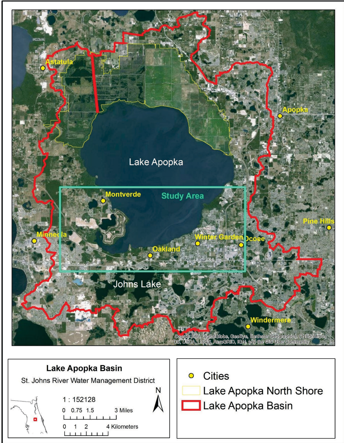
Figure 1. Lake Apopka Basin and study area.