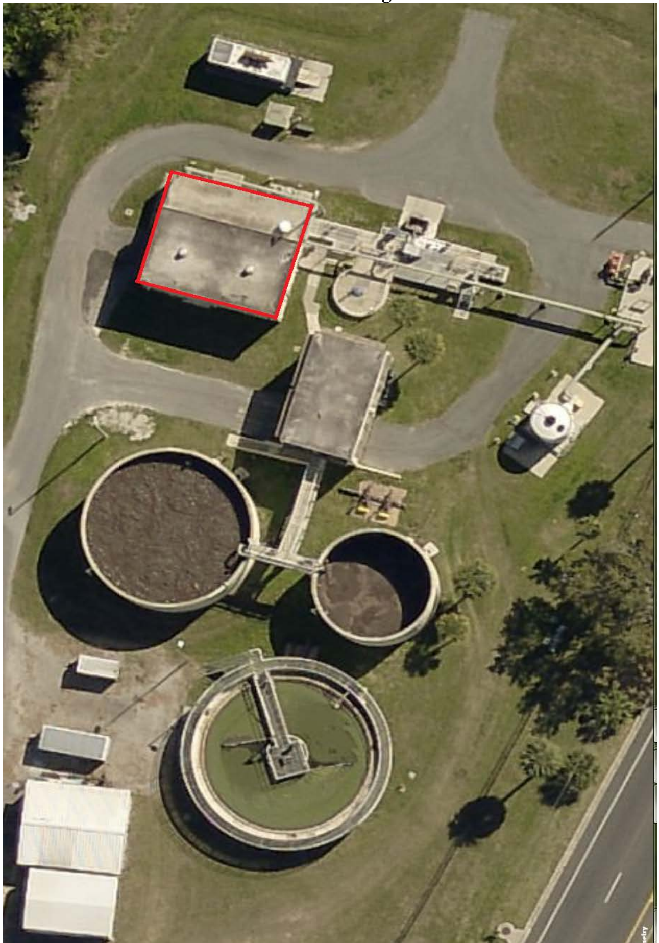
Headworks Building Roof