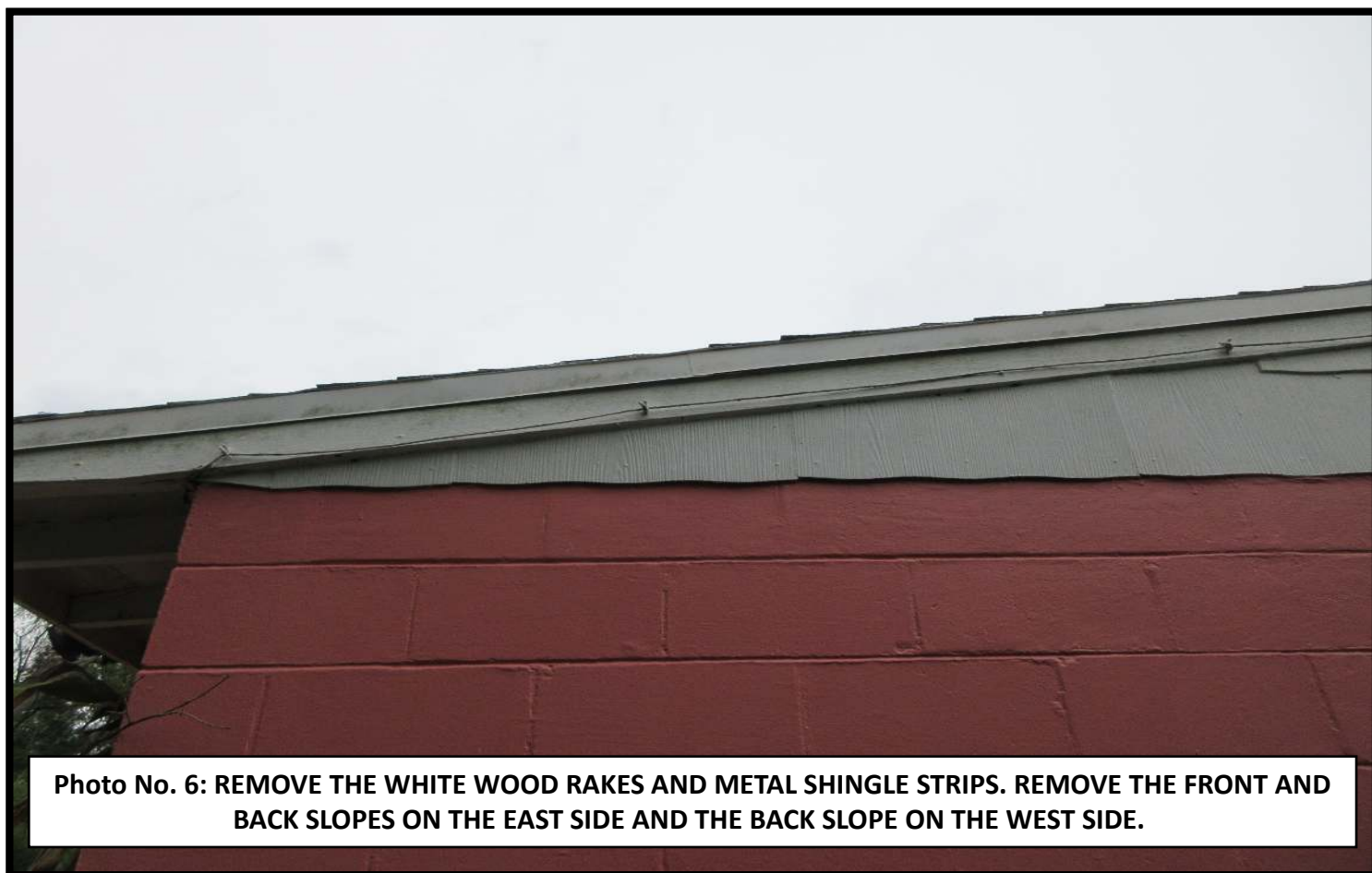
Photo No. 6: REMOVE THE WHITE WOOD RAKES AND METAL SHINGLE STRIPS. REMOVE THE FRONT AND BACK SLOPES ON THE EAST SIDE AND THE BACK SLOPE ON THE WEST SIDE.