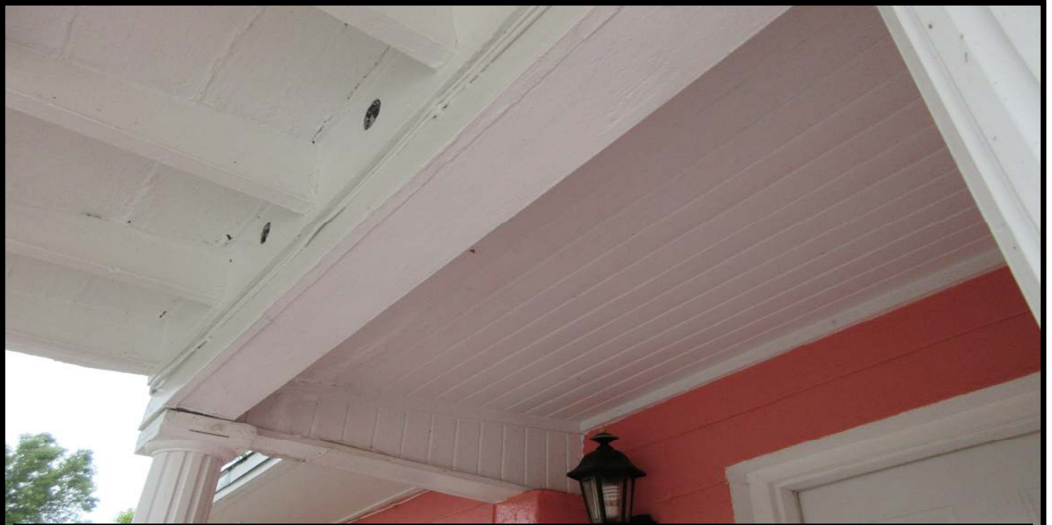
Photo No. 3: ENCAPSULATE THE WHITE WOOD FRONT PORCH CEILING AND HORIZONTAL SUPPORT MEMBERS THAT ARE COATED WITH LEAD-BASED PAINT. REMOVE CEILING TRIM ASSOCIATED WITH THE FRONT PORCH CEILING. REMOVE WHITE WOOD BEAM CASING LOCATED ABOVE THE FORMER CARPORT AND ON THE FRONT OF THE FRONT PORCH.