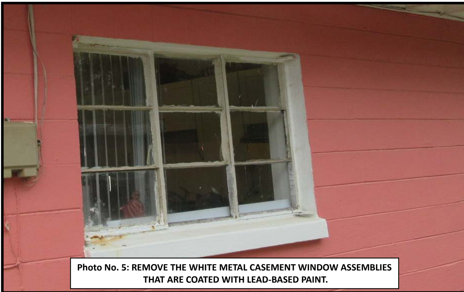
Photo No. 5: REMOVE THE WHITE METAL CASEMENT WINDOW ASSEMBLIES THAT ARE COATED WITH LEAD-BASED PAINT.