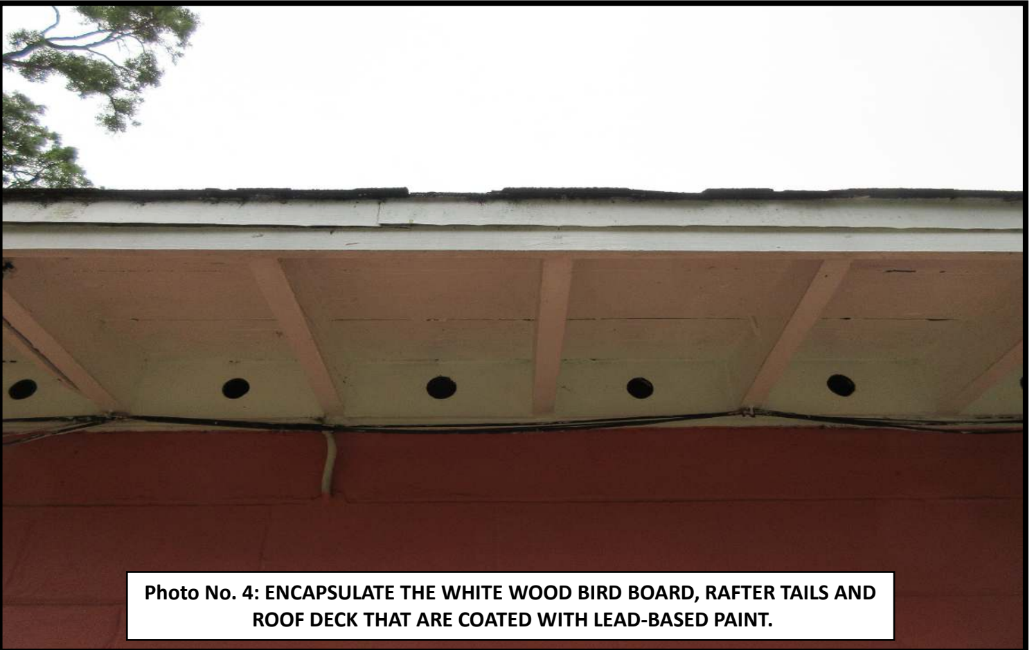
Photo No. 4: ENCAPSULATE THE WHITE WOOD BIRD BOARD, RAFTER TAILS AND ROOF DECK THAT ARE COATED WITH LEAD-BASED PAINT.