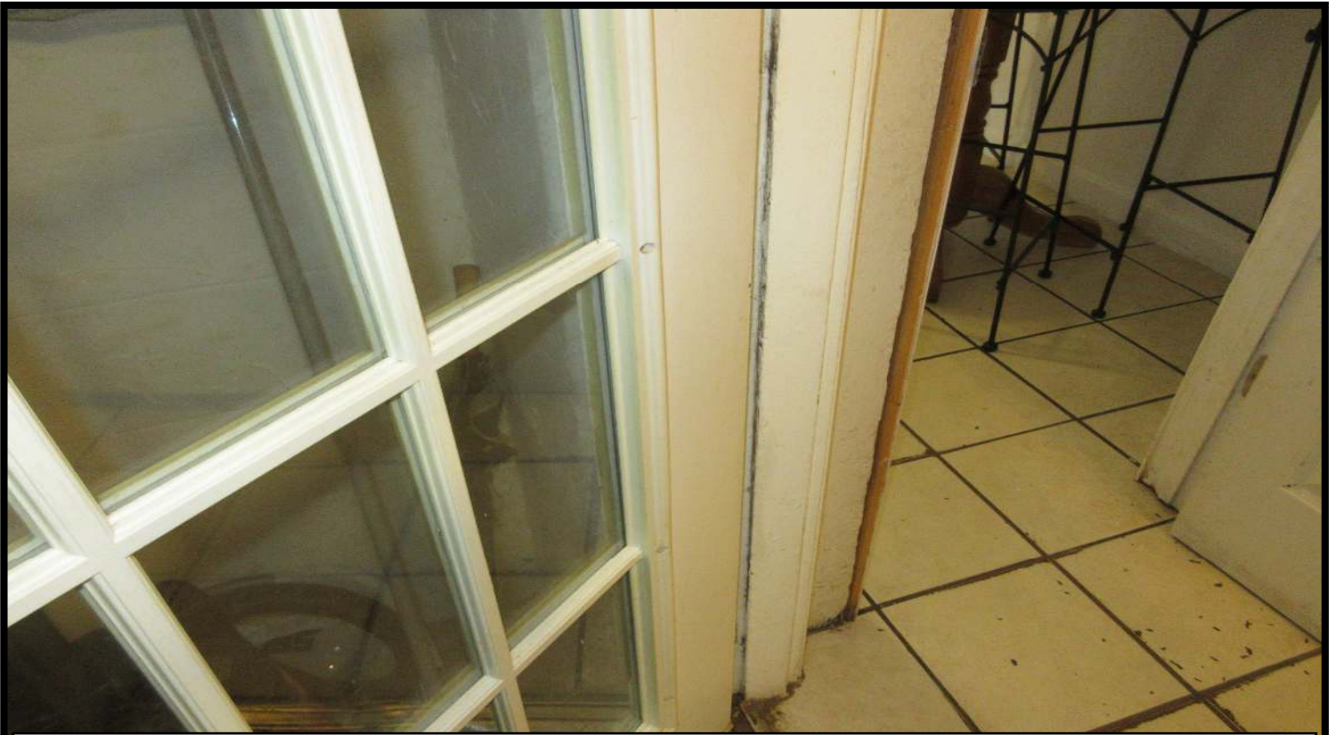
Photo No. 1: REMOVE THE WHITE WOOD DOOR ASSEMBLY LOCATED BETWEEN THE LAUNDRY ROOM AND THE EAST BEDROOM (FORMER CARPORT) THAT IS COATED WITH LEAD-BASED PAINT.