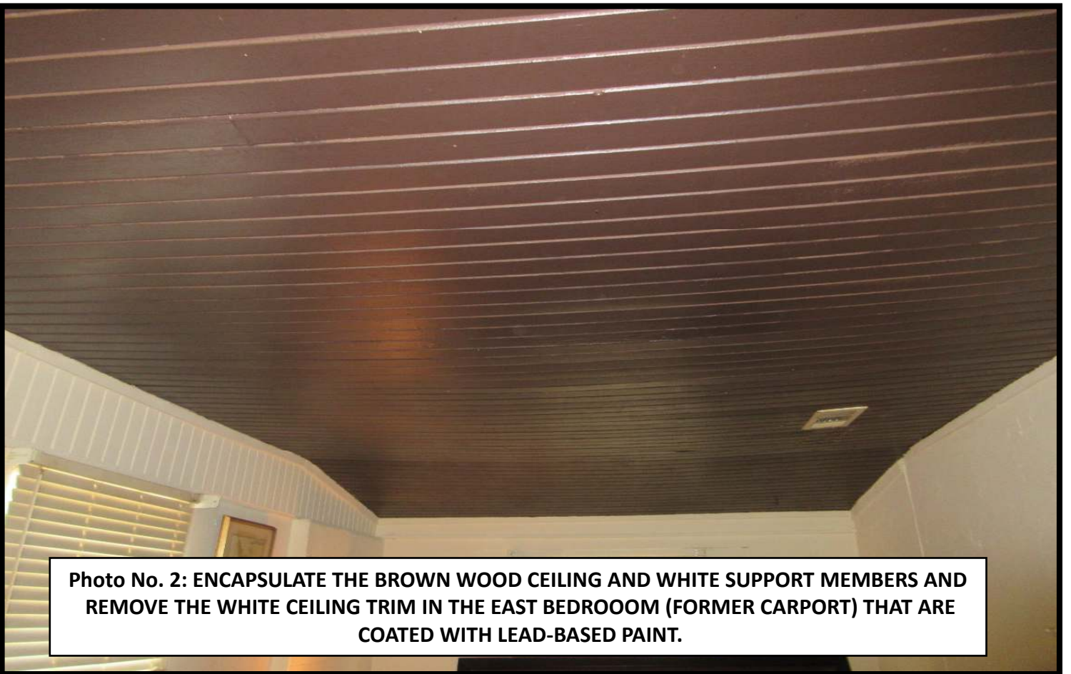
Photo No. 2: ENCAPSULATE THE BROWN WOOD CEILING AND WHITE SUPPORT MEMBERS AND REMOVE THE WHITE CEILING TRIM IN THE EAST BEDROOM (FORMER CARPORT) THAT ARE COATED WITH LEAD-BASED PAINT.