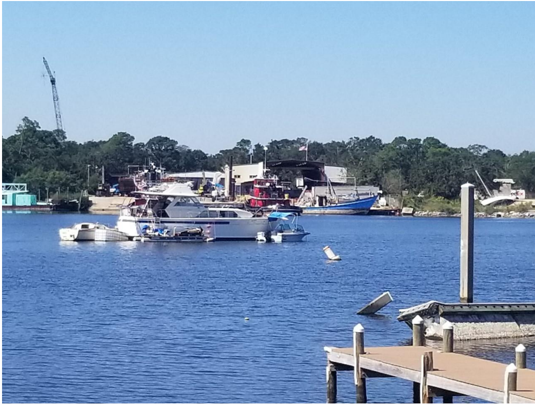
Vessel prior to sinking, right side of larger vessel in the middle.