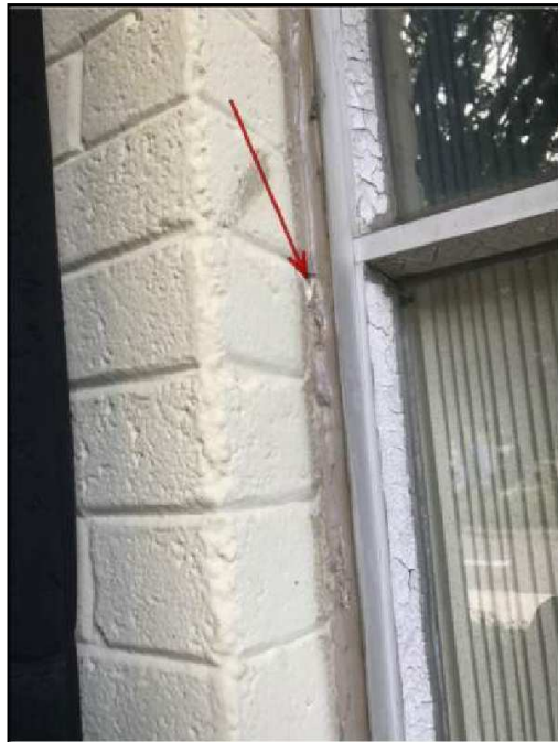
4 - View of Asbestos-Containing White Window Caulk on Exterior Windows. Sample No. 127-B.