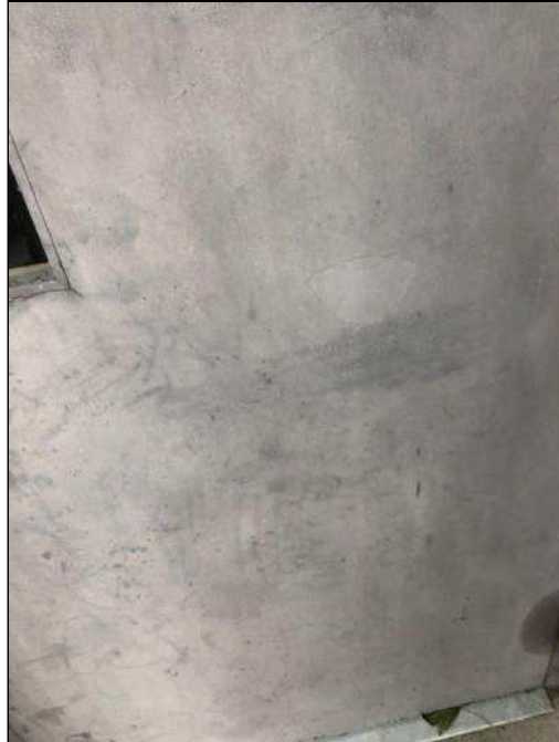
9 - View of Lead Based Paint on a Dark Gray Metal Door. XRF Reading Nos. 1050 and 1051.