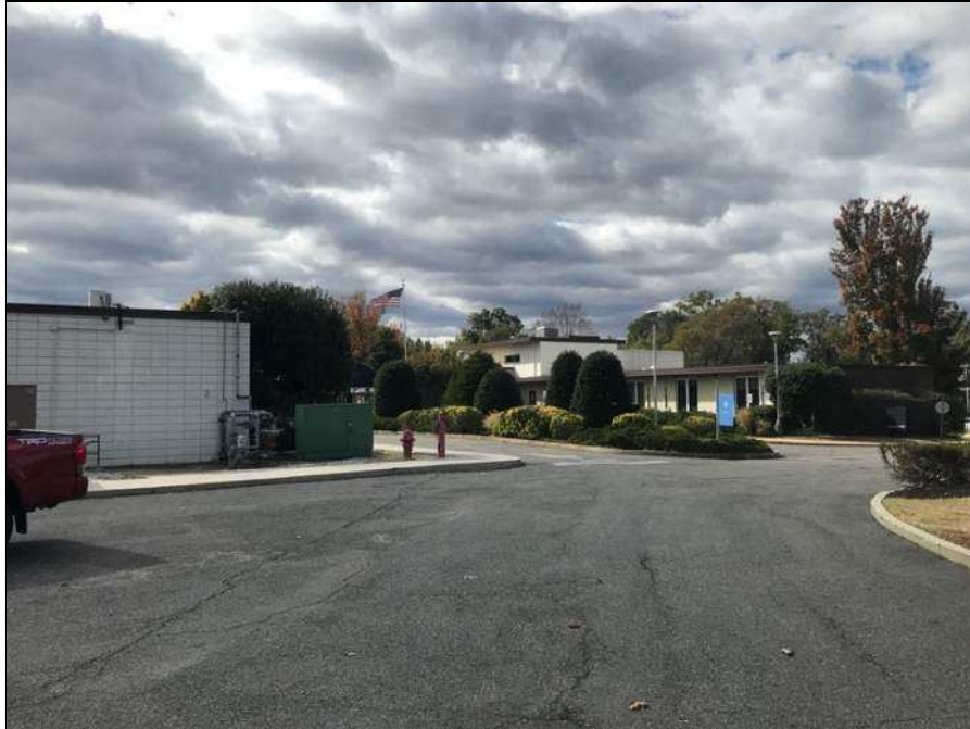
1 - View of the Northern One-Story and Two-Story Sections of the Building.