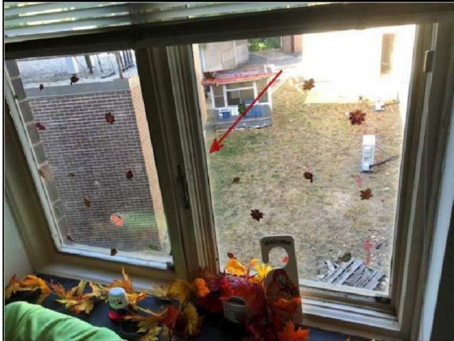
7 - View of Asbestos-Containing Interior Black Window Glazing on Connecting Building Windows. Sample No. 179.