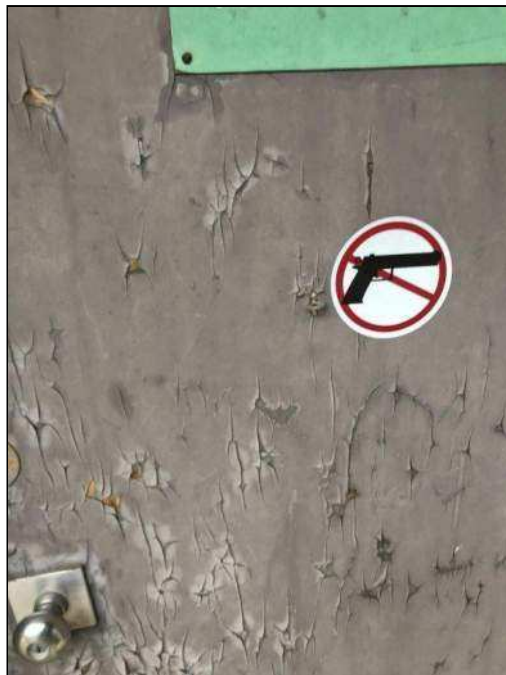
10 - View of Lead Based Paint on a Brown Metal Door. XRF Reading No. 1056.