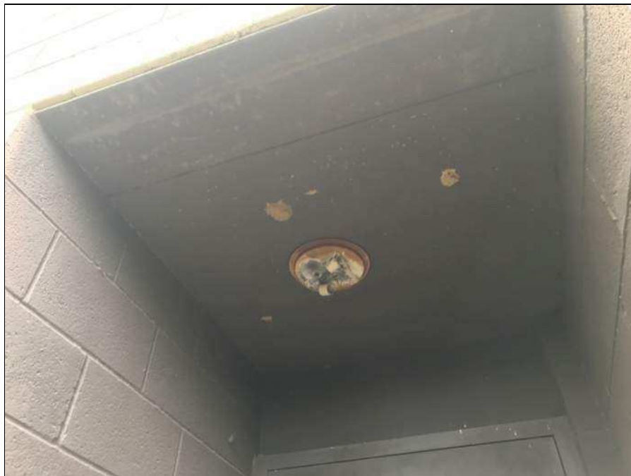
6 - View of Damaged Asbestos-Containing Light Shield Insulation on Exterior Soffits. Sample No. 164.