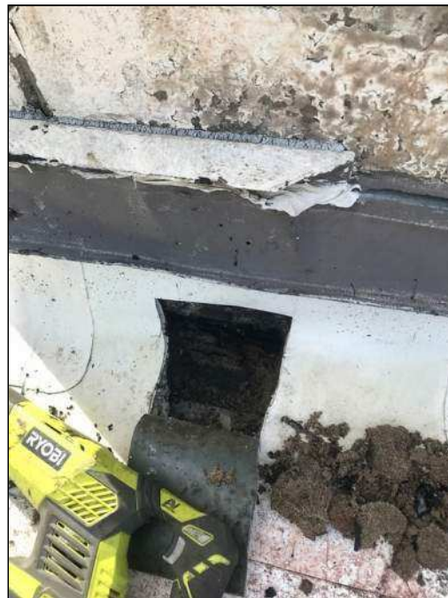
2 - View of Asbestos-Containing Multiple Layered Flashing Caulk on the Connecting Building Parapet Wall. Sample No. 61.