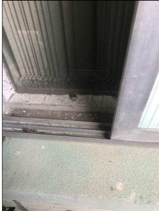
3 - View of Asbestos-Containing Gray Window Glaze on Exterior Windows. Sample No. 125.