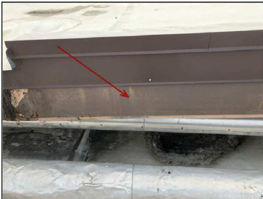
8 - View of Lead Based Paint on a Red Metal Beam on the Roof. XRF Reading No. 1031.