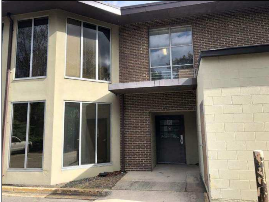
11 - View of Lead Based Paint on a Brown Metal Door. XRF Reading No. 1077.