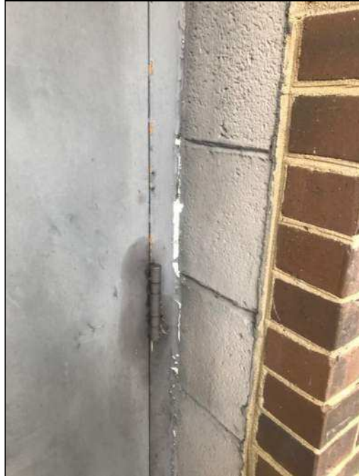
5 - View of Asbestos-Containing Tan Door Caulk on Exterior Doors. Sample No. 149.