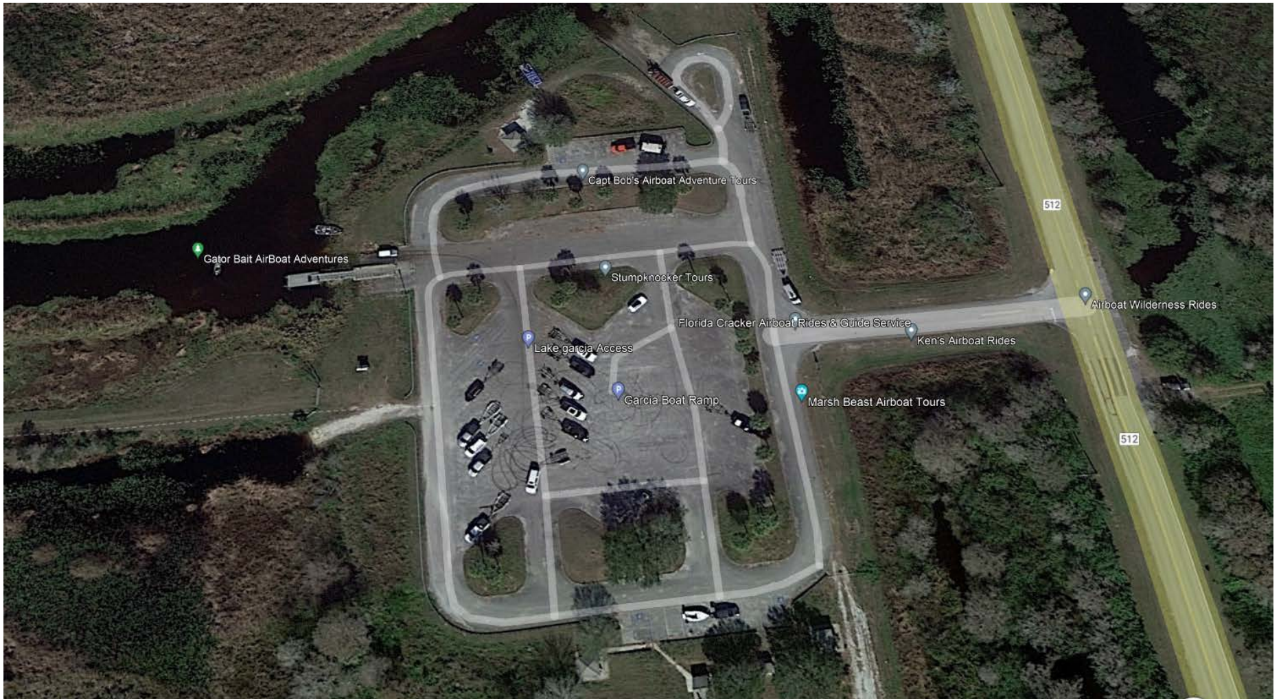
L-512 Recreation Area