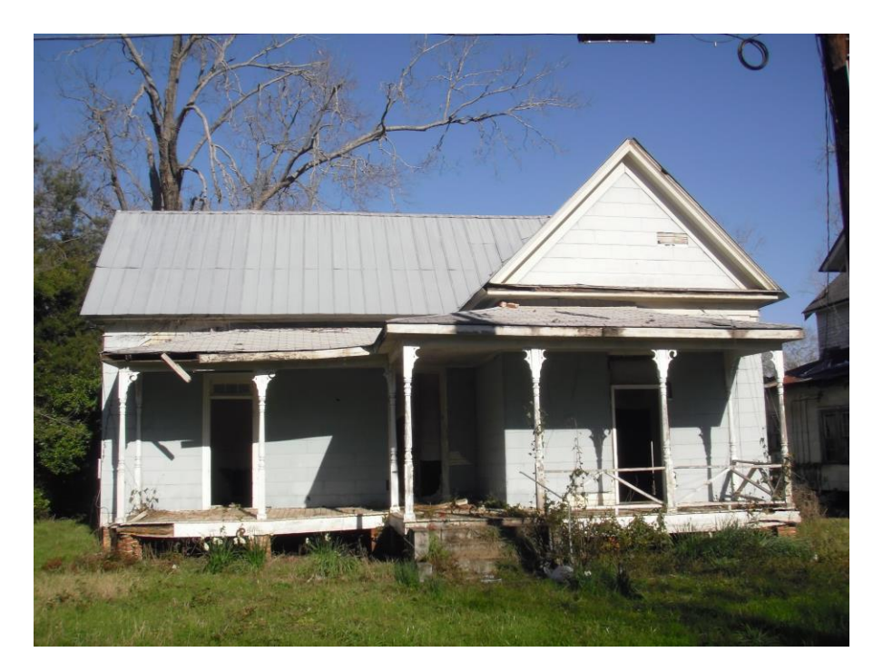
303 E. Johnson St. – siding tested positive for asbestos

Houses with asbestos to be abated and demolished: