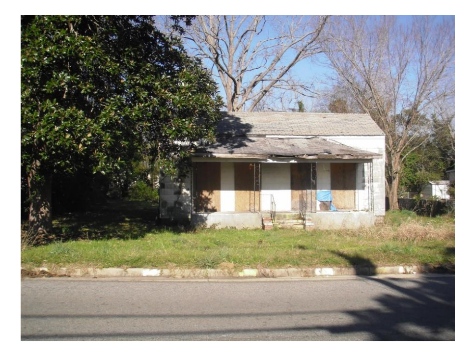
303 E. Mary St. - siding tested positive for asbestos