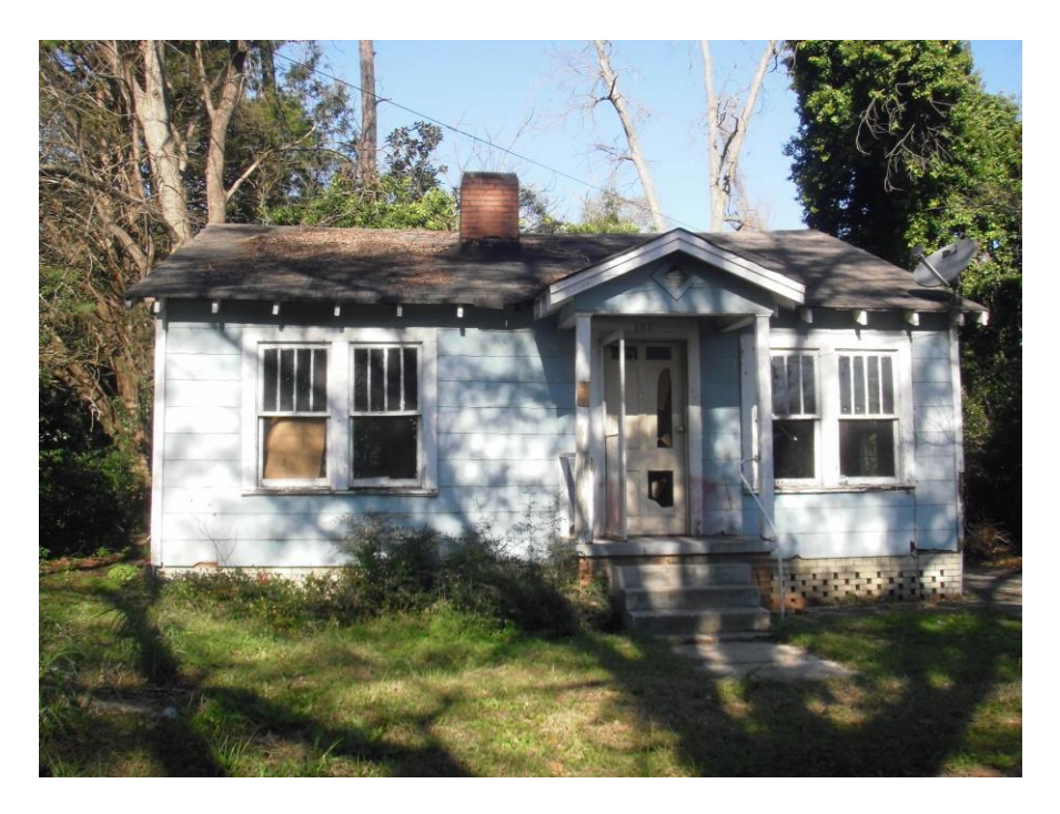
205 Prince St. - siding tested positive for asbestos