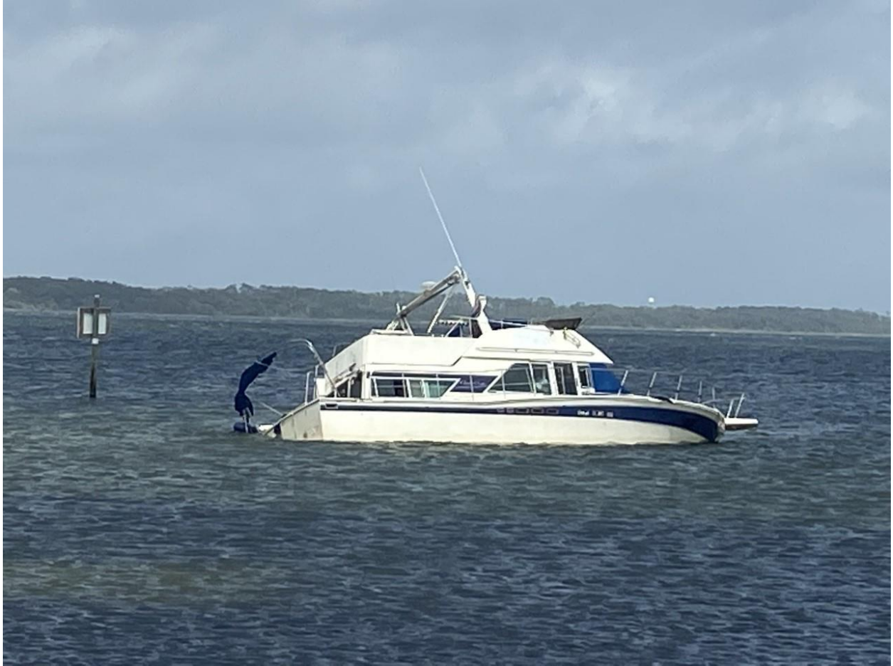
Vessel post Hurricane Ida