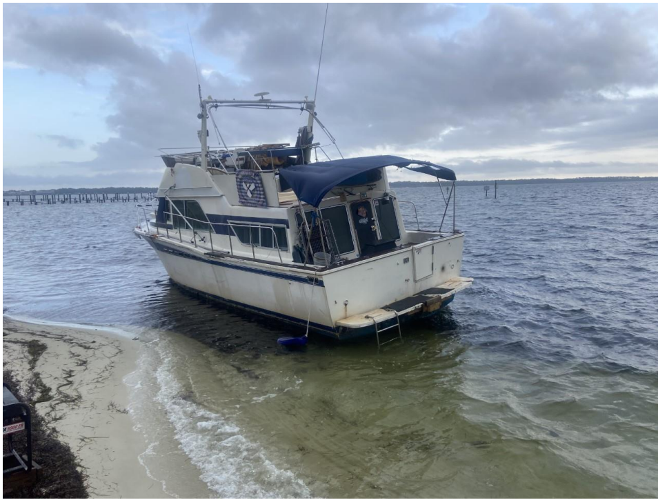
Vessel before Hurricane Ida