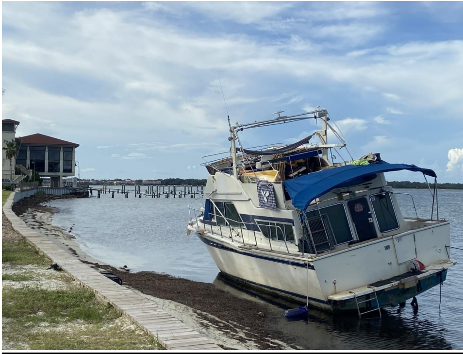
Vessel before Hurricane Ida