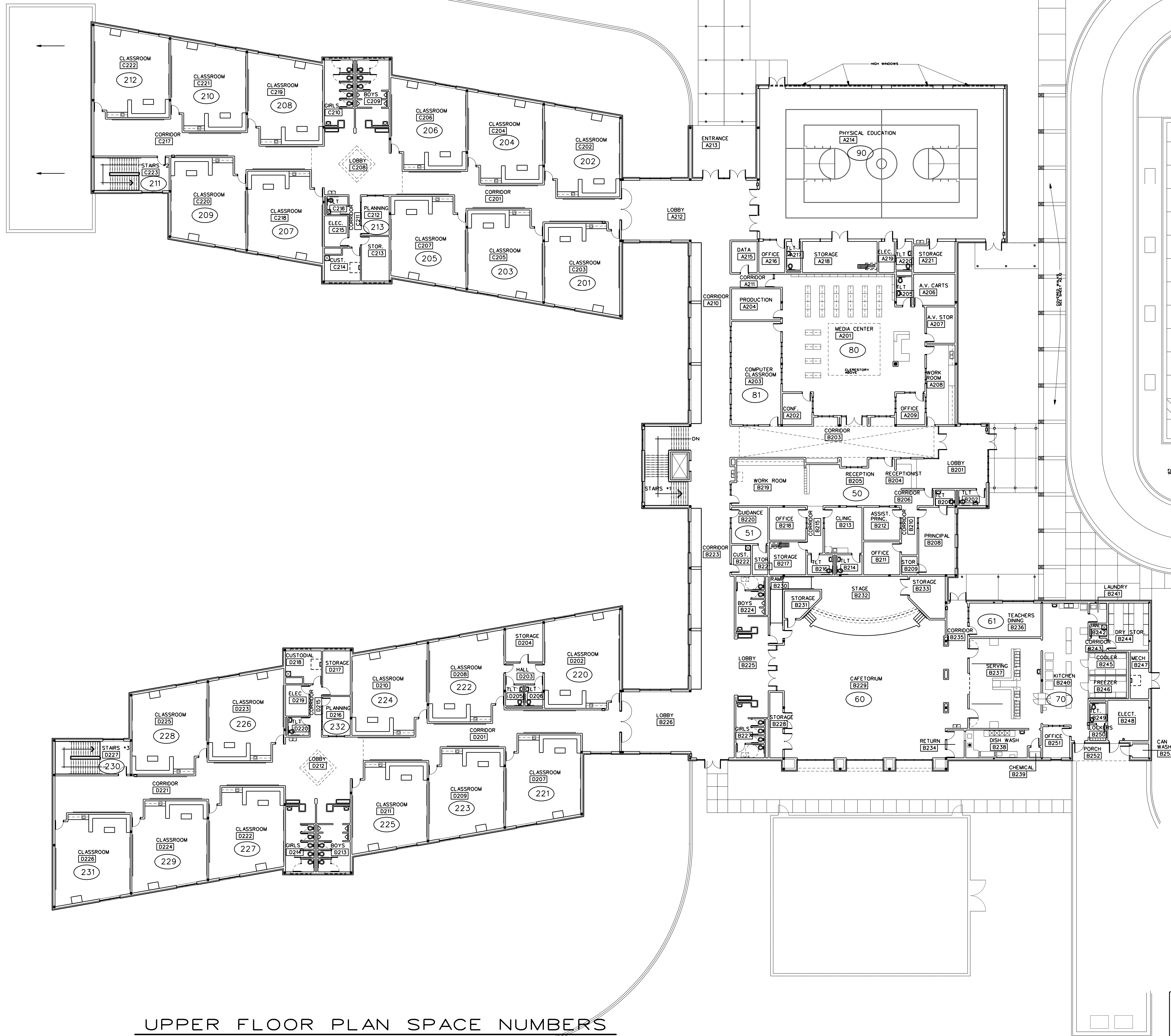
UPPER FLOOR PLAN SPACE NUMBERS SCALE: 1/8" = 1'-0"