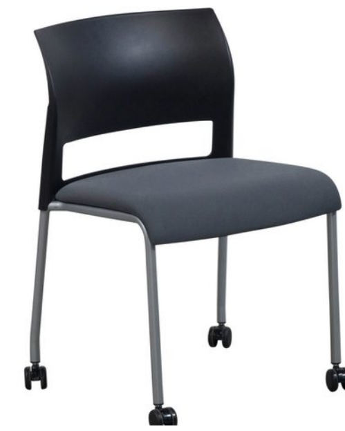
D OFFICE GUEST CHAIR