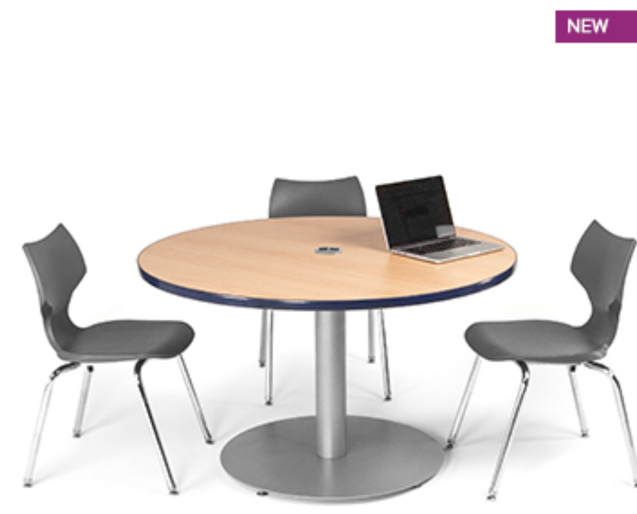
K MULTIPURPOSE TABLE