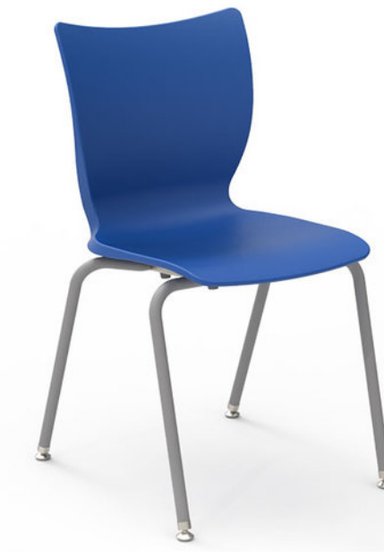
E CAFETERIA CHAIR