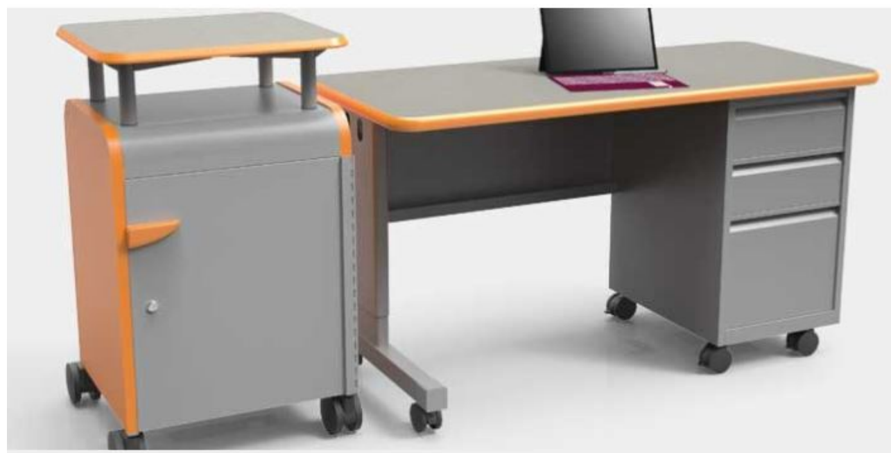
F TEACHER DESK