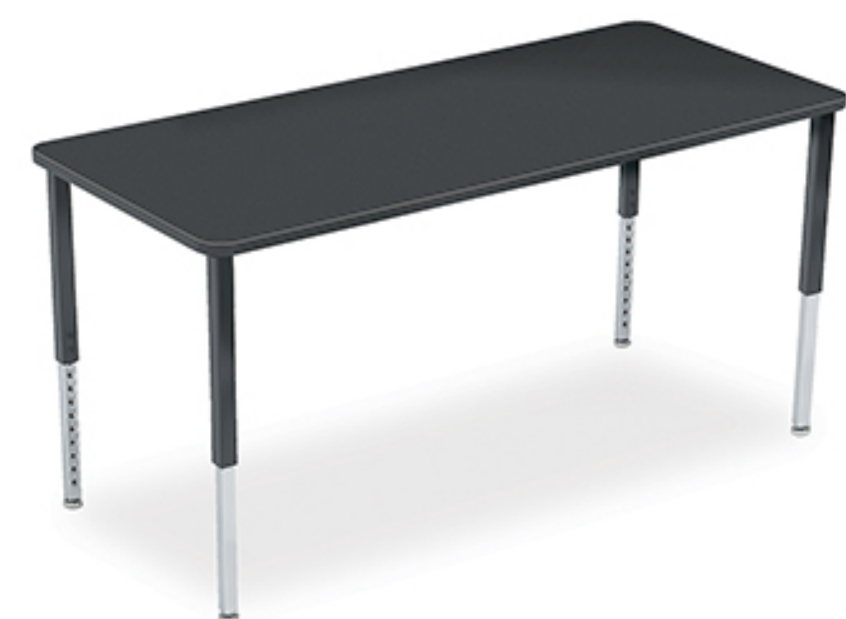
M SCIENCE LAB CHEM TOP TABLE