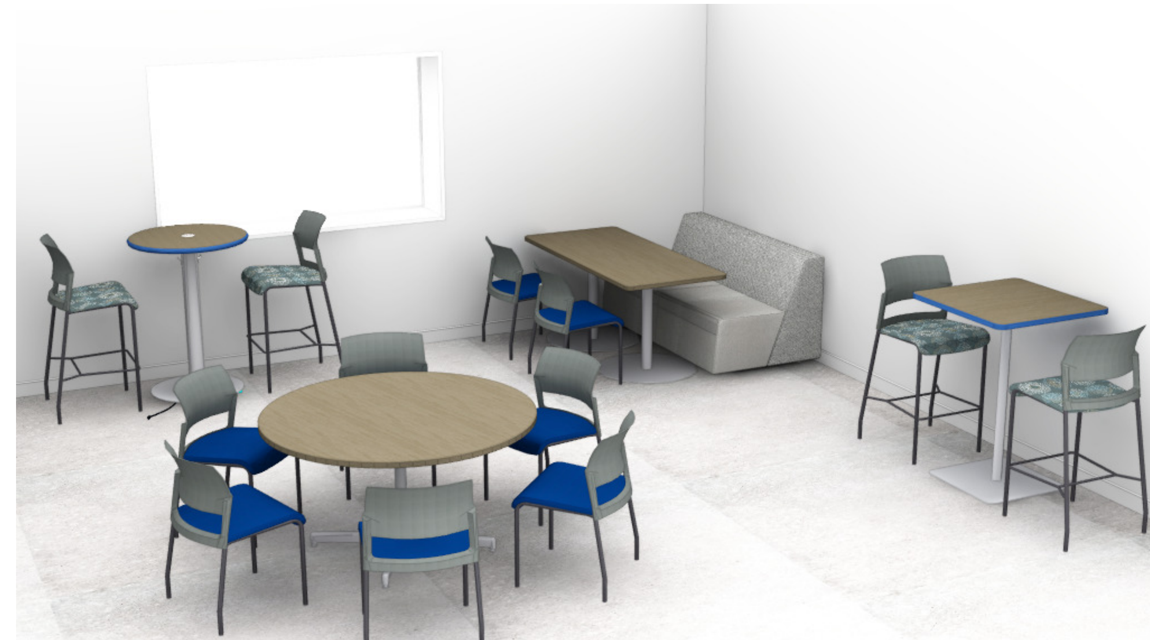
R BREAKROOM- EXAMPLE