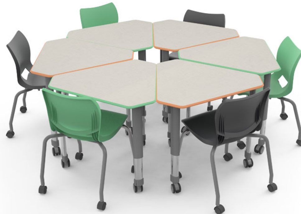
H CLASSROOM TABLES