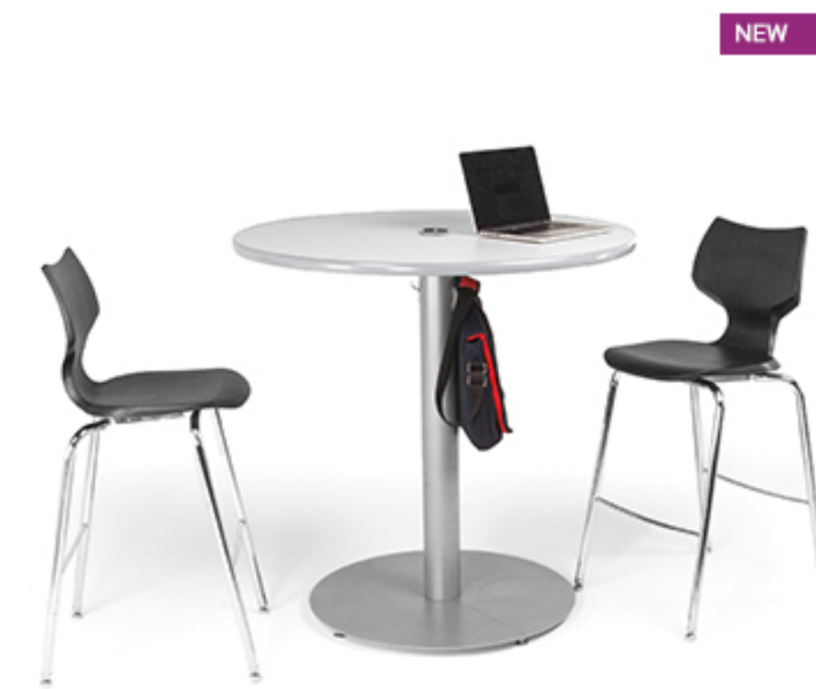
MULTIPURPOSE TABLE STANDING HEIGHT