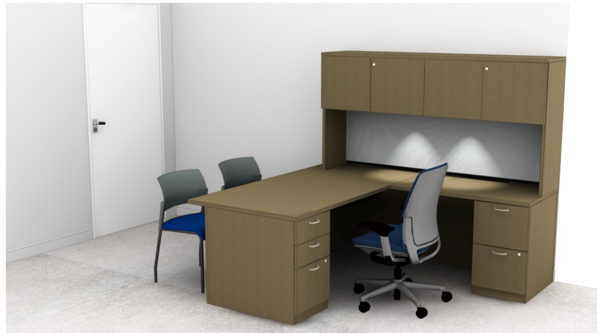
O OFFICE- TYPICAL