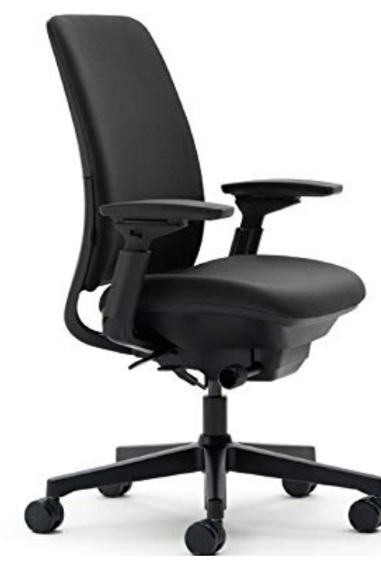
C OFFICE TASK CHAIR