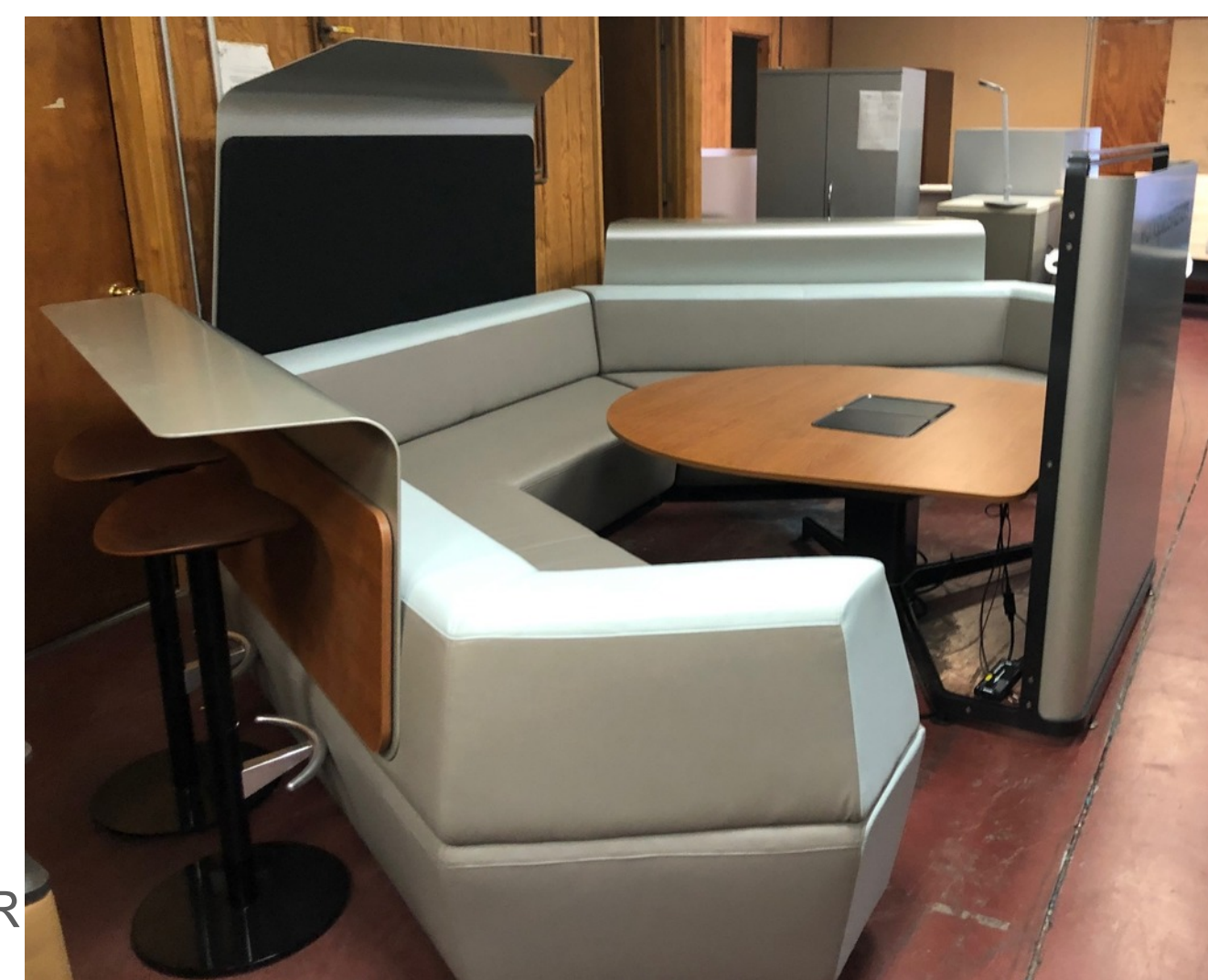
S LIBRARY MEDIASCAPE- PHOTO