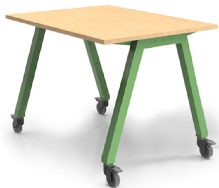
L BUTCHER BLOCK MAKER SPACE TABLE