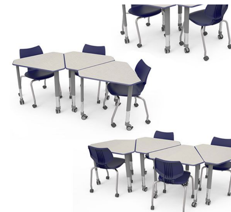
TABLE CONFIGURATION EXAMPLES