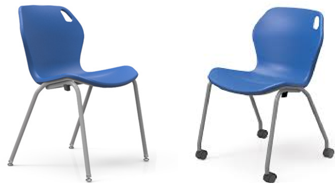
A CLASSROOM STUDENT CHAIR