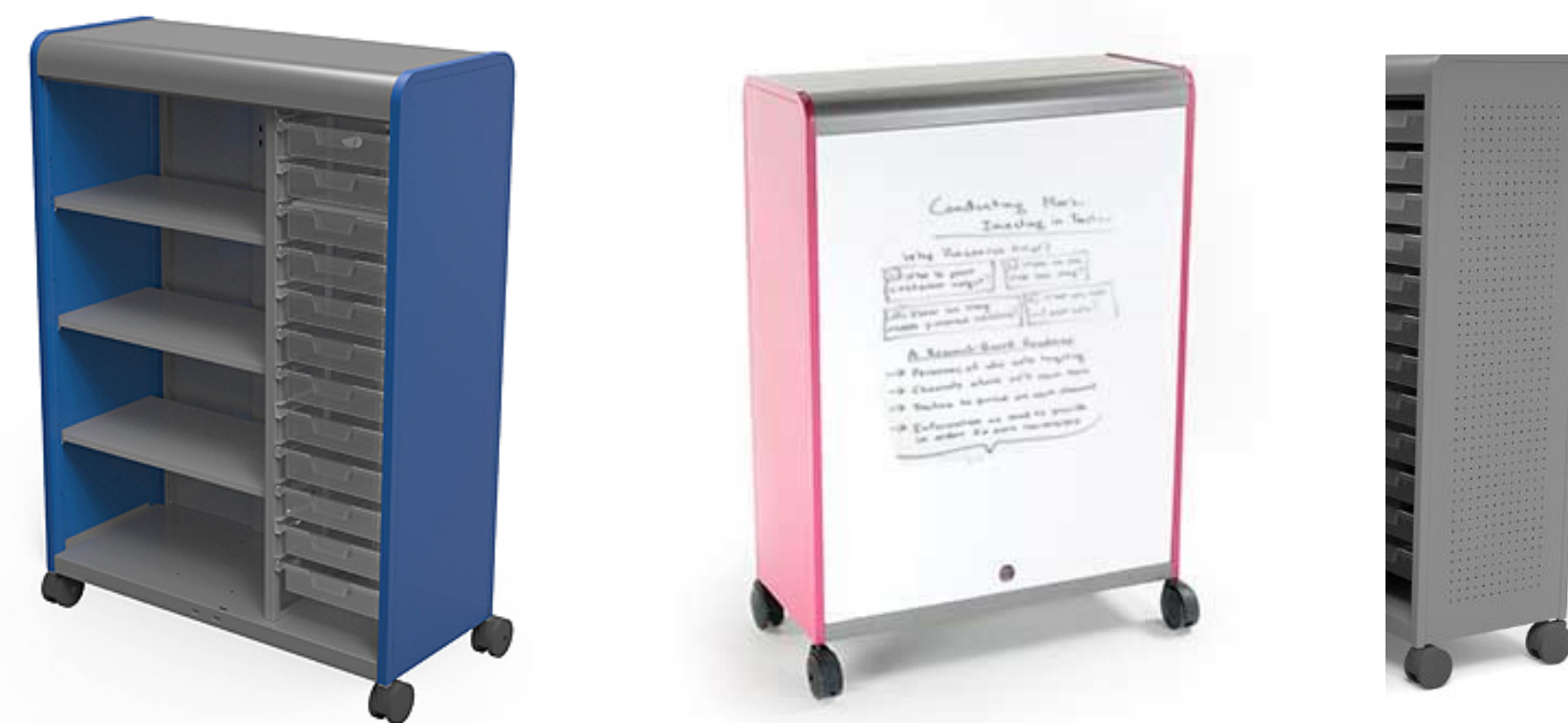
N MOBILE STORAGE WITH PEGBOARD, WHITEBOARD, AND REMOVABLE BINS

GENERAL NOTES: - FINISHES ARE TO BE DECIDED - RENDERINGS ARE CONCEPTUAL ONLY - DRAWINGS ARE NOT ACCURATE FOR ARCHITECTURAL OR OTHER CONDITIONS - DRAWINGS RELEVANT FOR FURNITURE ITEMS ONLY.