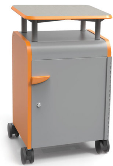
G INSTRUCTOR STATION