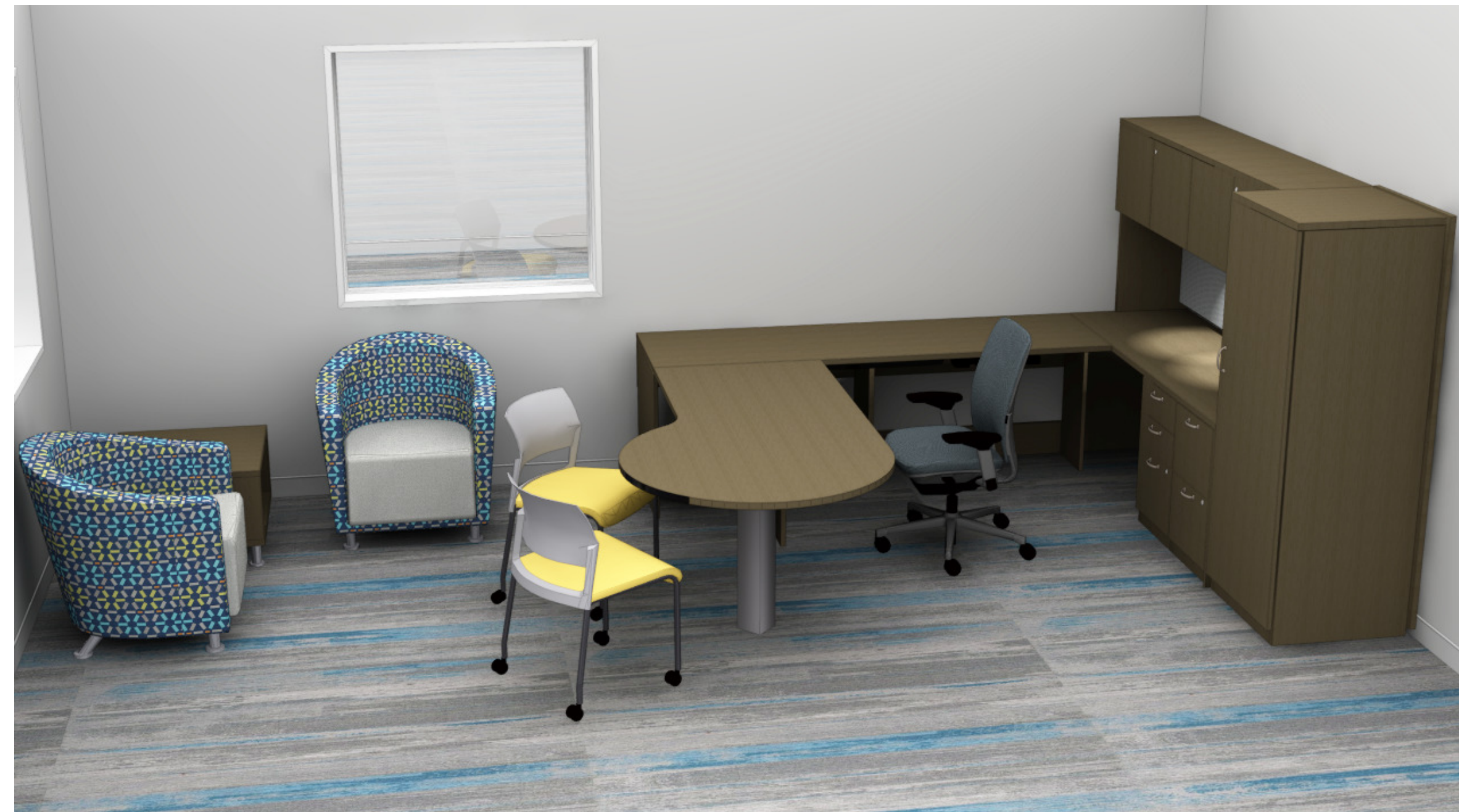
Q VICE PRINCIPAL'S OFFICE