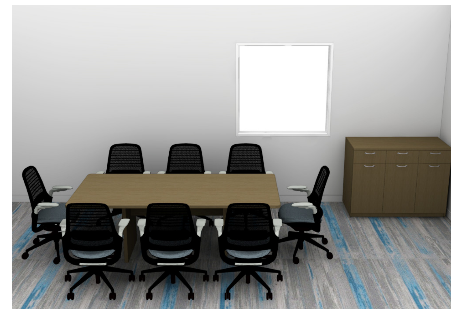
S CONFERENCE ROOM- TYPICAL

GENERAL NOTES: - FINISHES ARE TO BE DECIDED - RENDERINGS ARE CONCEPTUAL ONLY - DRAWINGS ARE NOT ACCURATE FOR ARCHITECTURAL OR OTHER CONDITIONS - DRAWINGS RELEVANT FOR FURNITURE ITEMS ONLY.