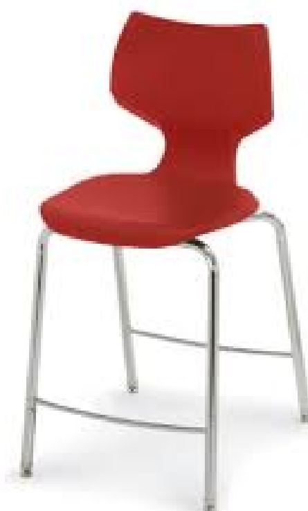
J SCIENCE LAB, ART, AND MAKERPACE STOOL