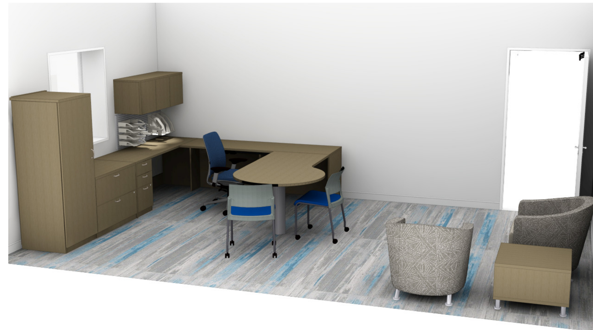
P PRINCIPAL'S OFFICE