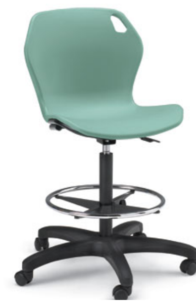
B CLASSROOM TEACHER STOOL