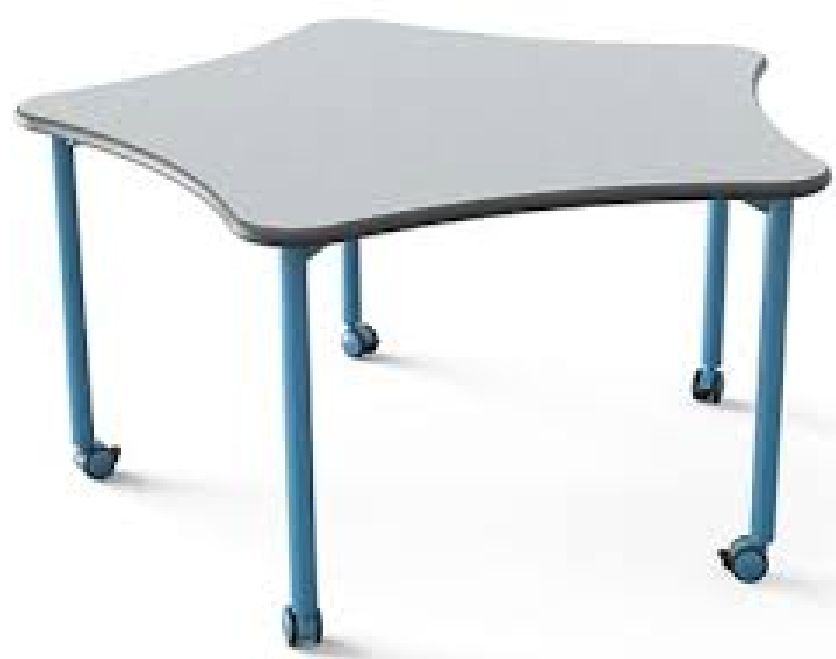
I LIBRARY STAR TABLE