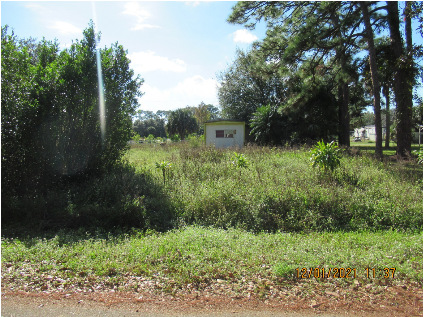
17204 Brynwood Lane, Okeechobee Florida