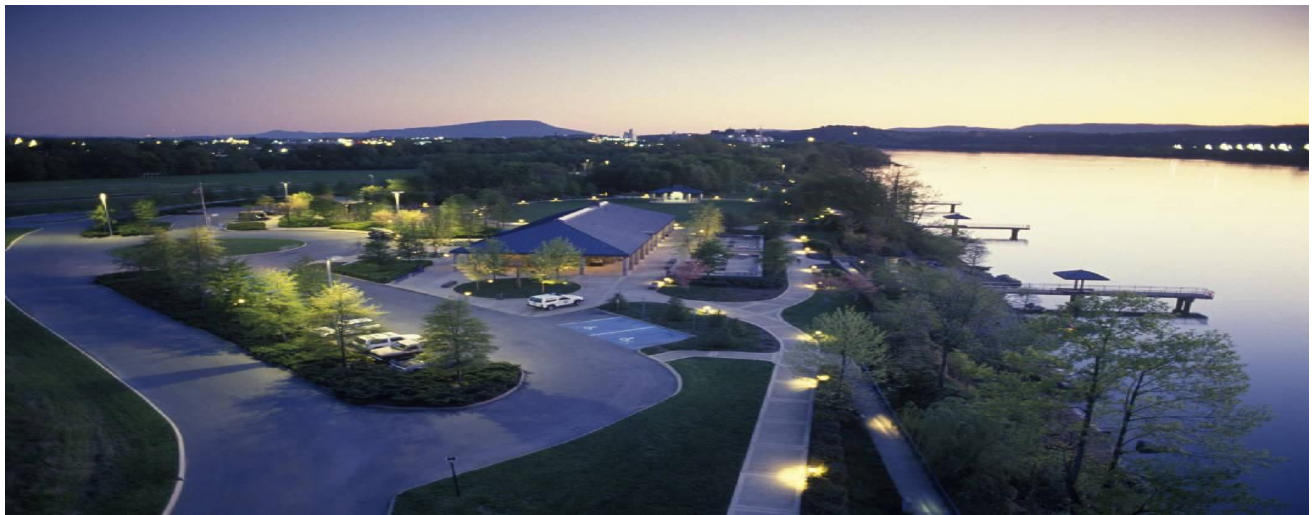
Hamilton County TN Riverpark