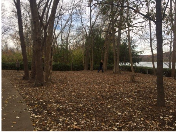
Site option 1 (wooded area)