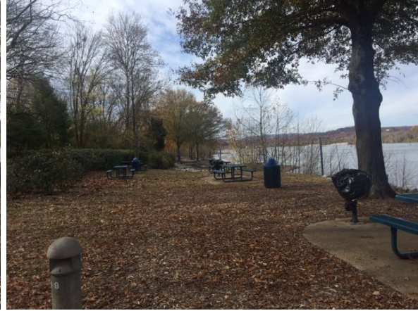
Site option 2 (riverfront site)