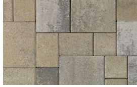
GRAY - MOSS - CHARCOAL