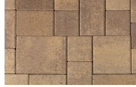
SAND - STONE - MOCHA