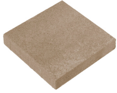
15x15 Courtyard Stone 14.76" x 14.76