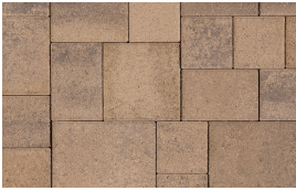
ADobe - COPPER - MOCHA

Blended Colors (swatches shown in Courtyard Stone)