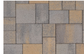
DARK GRAY - COPPER - CHARCOAL