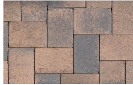
CREAM - BROWN - CHARCOAL