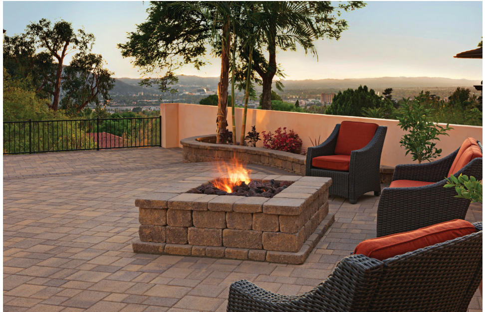
Shown: Sand-Stone-Mocha Courtyard Stone installed in an ashlar pattern with a solid Mocha Holland border. The planter wall and fire pit are Stonewall® II in Sand-Stone-Mocha.

*Available in standard and tumbled textures