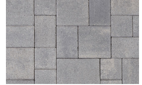
DARK GRAY - PEWTER - CHARCOAL