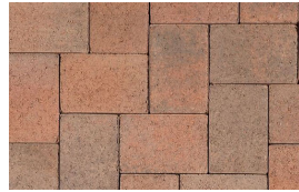
CREAM - TERRACOTTA - BROWN