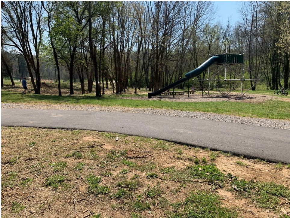
(8) Baker Creek Play Forest: South direction