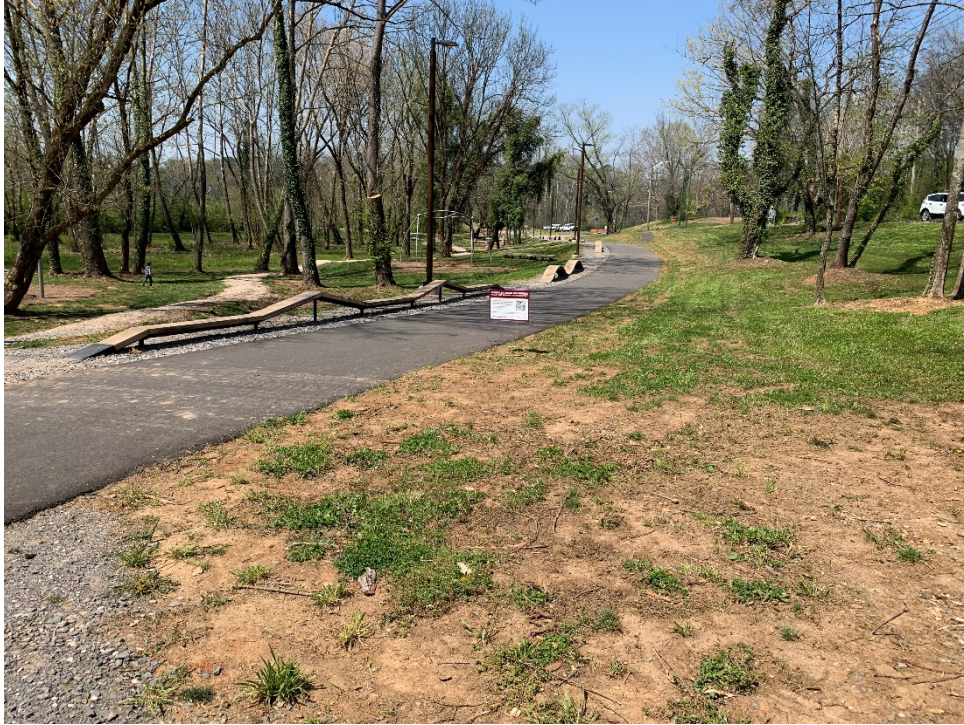
(5) Baker Creek Play Forest: West direction