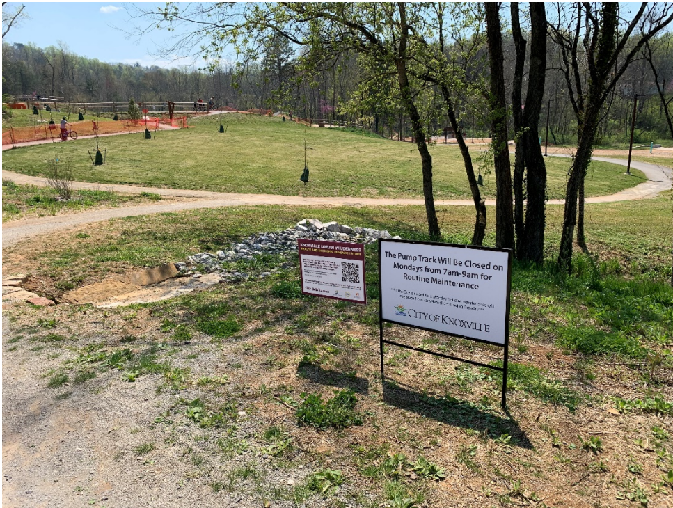
(10) Baker Creek Bicycle Pump Track Entrance