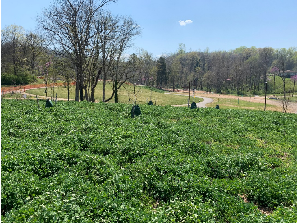
(9) Baker Creek Bicycle Pump Track Entrance: South direction, “Wildflower Bed”