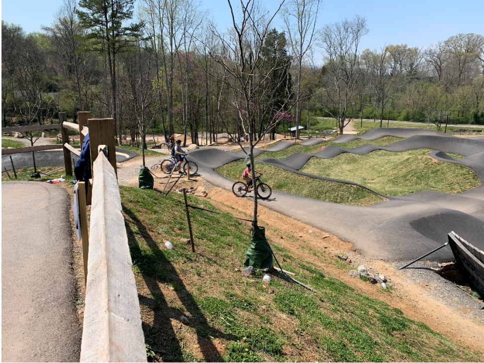
(11) Baker Creek Bicycle Pump Track Entrance: Southeast direction