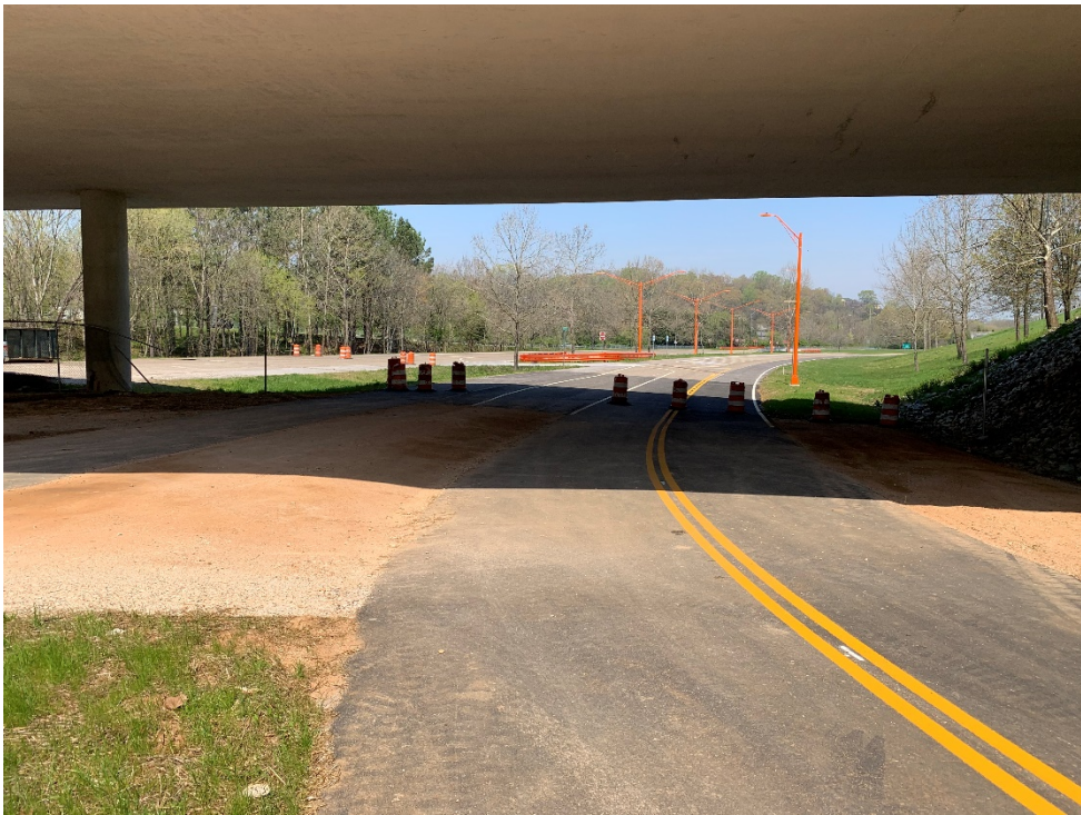
(4) Urban Wilderness Gateway Park at JWP Terminus: North direction