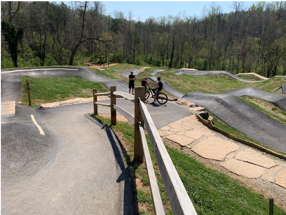
(12) Baker Creek Bicycle Pump Track Entrance: South direction