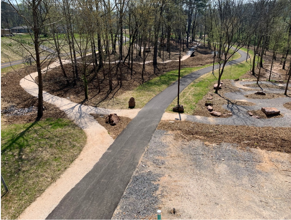
(1) Urban Wilderness Gateway Park: South direction from Sevierville Pike