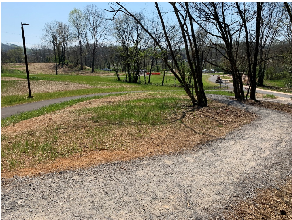
(2) Urban Wilderness Gateway Park: South direction