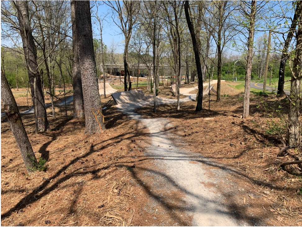
(3) Urban Wilderness Gateway Park: North direction