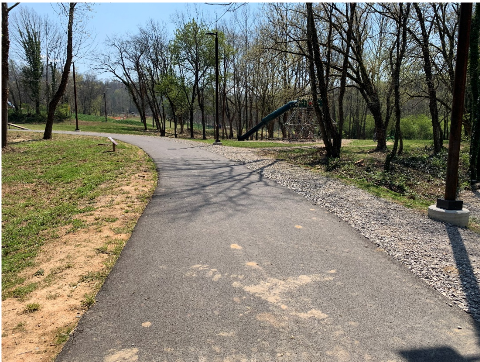
(6) Baker Creek Play Forest: East direction