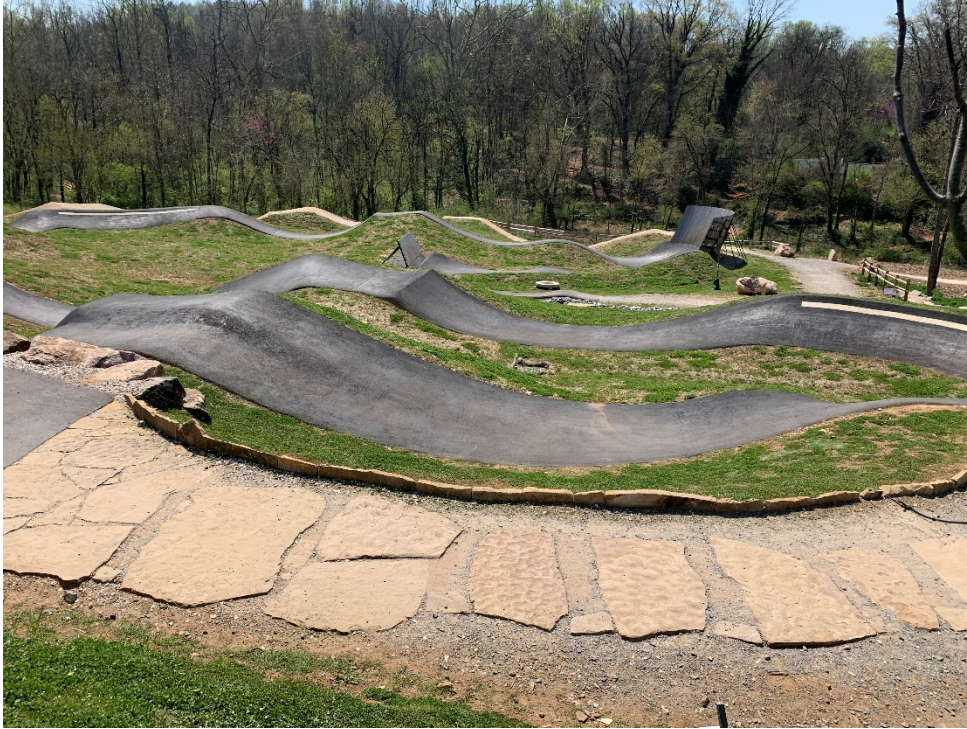
(13) Baker Creek Bicycle Pump Track Entrance: East direction