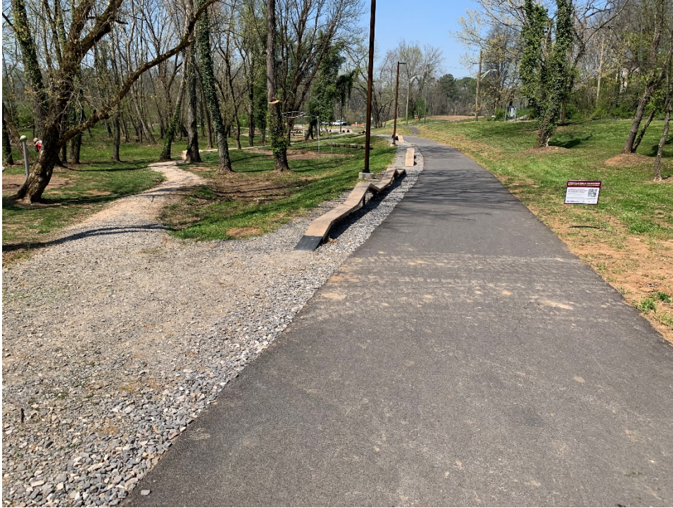
(7) Baker Creek Play Forest: West direction