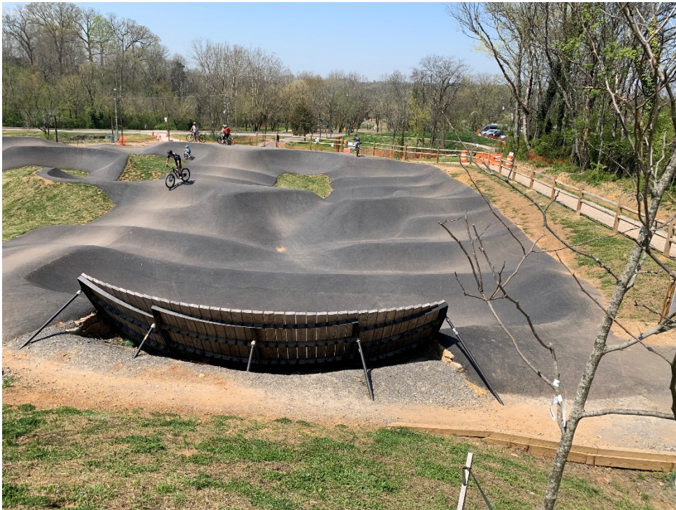
(14) Baker Creek Bicycle Pump Track Entrance: West direction