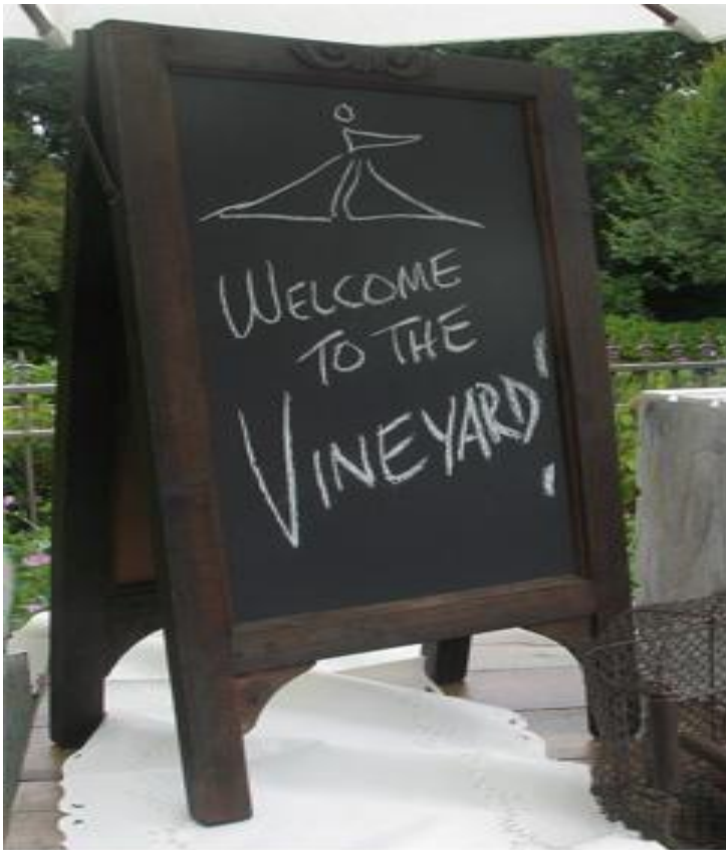
25" 'A' Frame Vintage Blackboard Stand