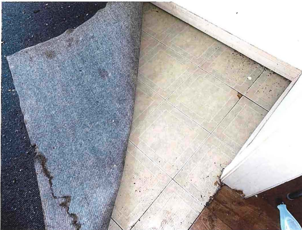
12"X 12" Floor Tile (Tan) Self Stick, Laundry Room & Master Closet