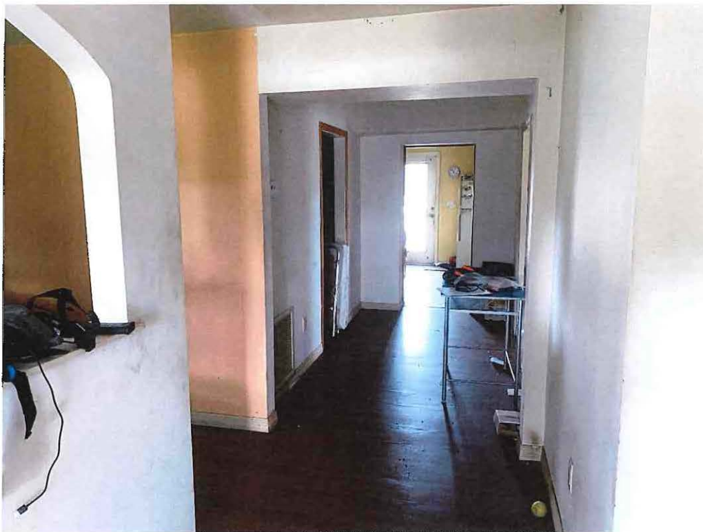
Overview of Interior