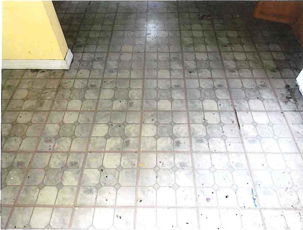
12"X 12" Floor Tile (Beige) Self Stick, Kitchen