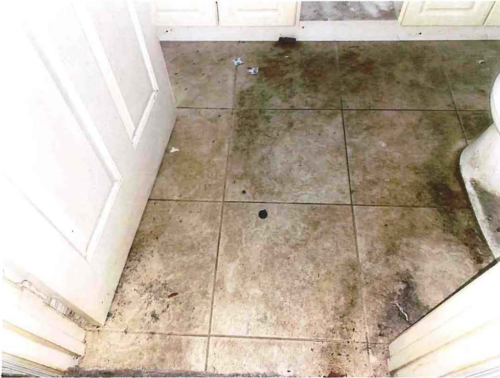
Ceramic Tile (Tan), Master and Spare Bathrooms