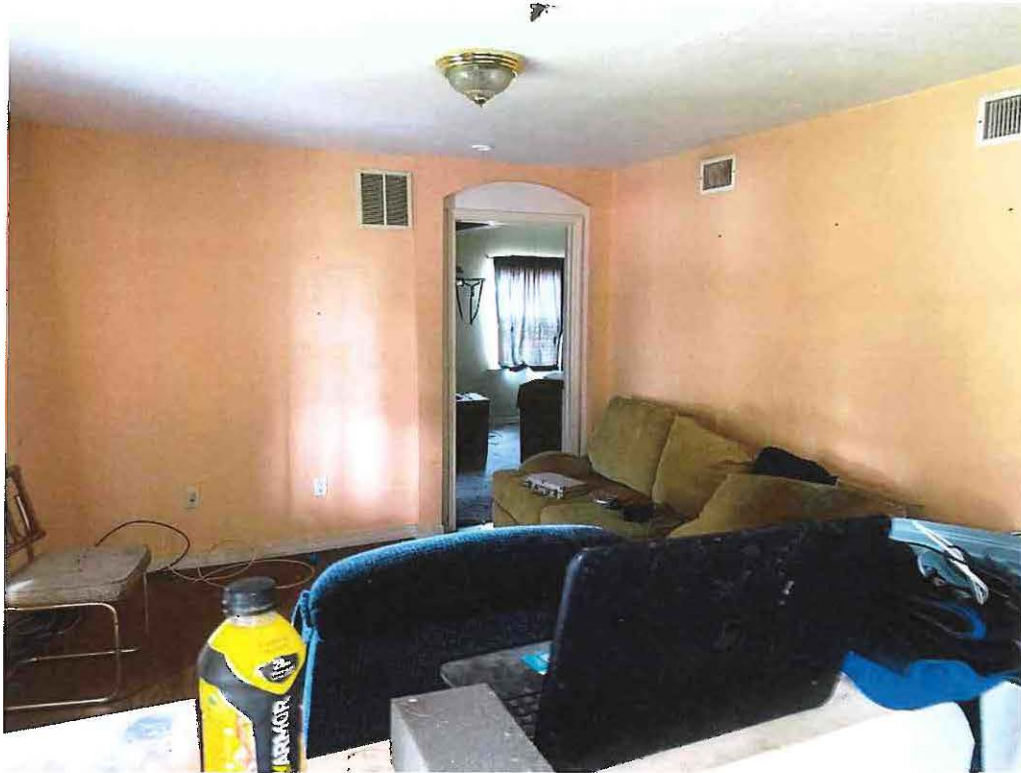
Overview Of Interior