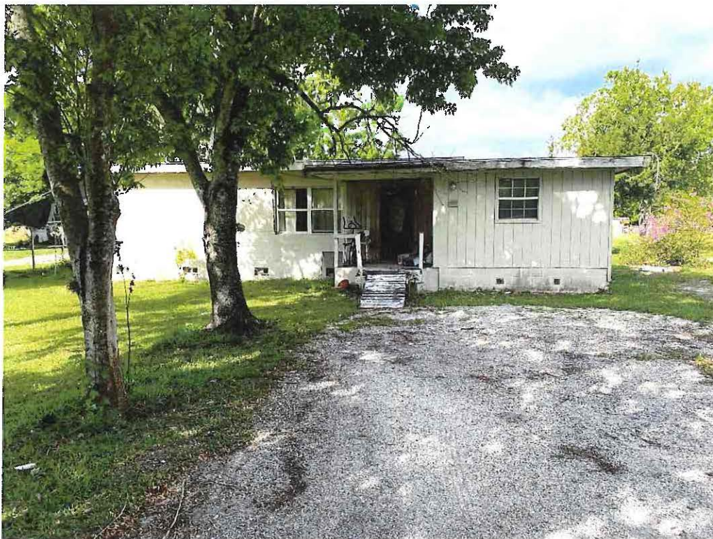
Looking West at Residential Structure