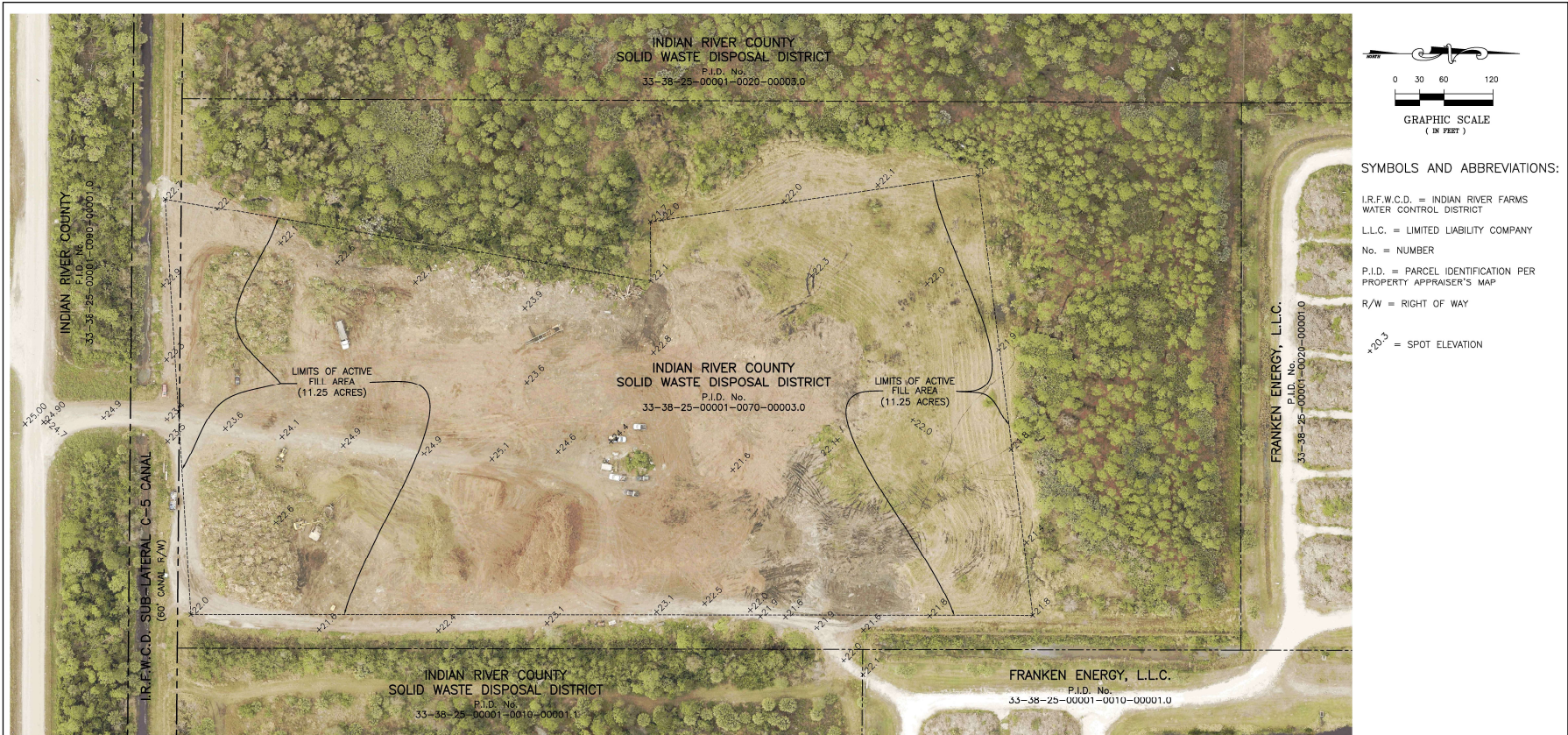
Exhibit A Yard Waste Facility Topographic Survey