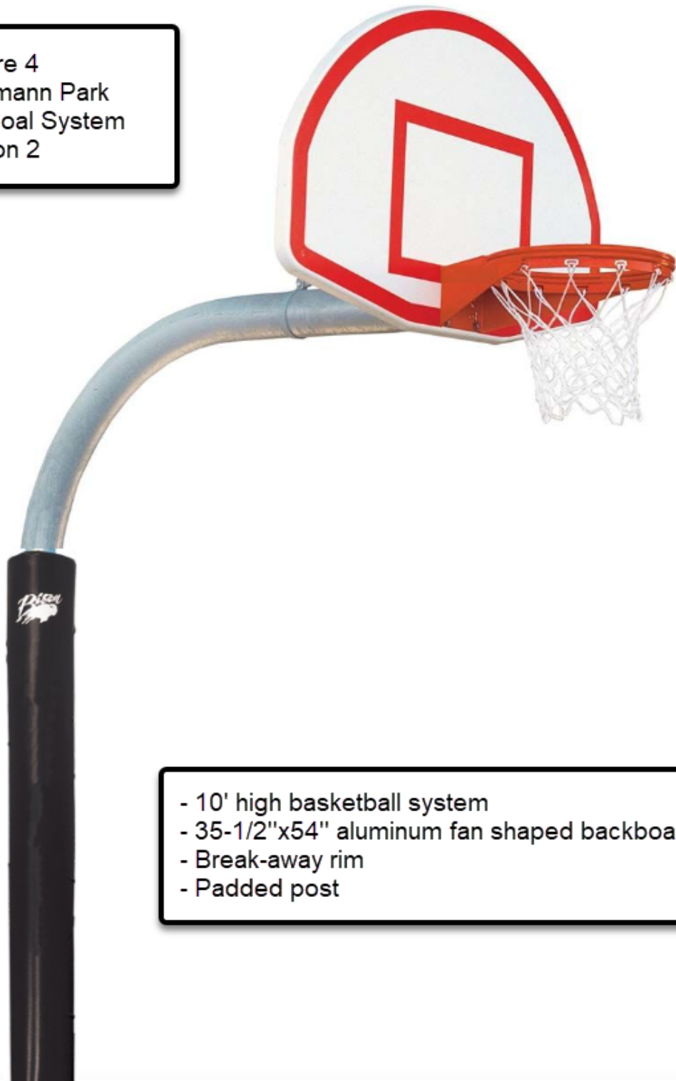
Figure 4 Hosie Shumann Park Basketball Goal System Option 2