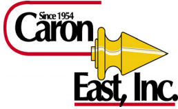
EXHIBIT A - QUOTE