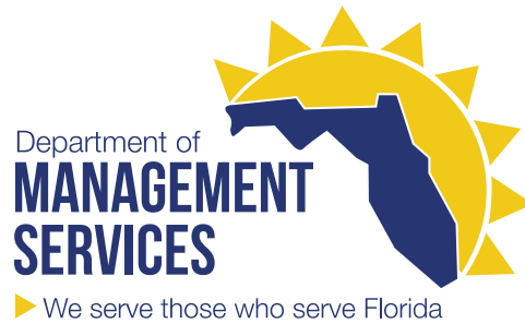
EXHIBIT A ADDITIONAL SPECIAL CONTRACT CONDITIONS

The Contractor and agencies, as defined in section 287.012, Florida Statutes, acknowledge and agree to be bound by the terms and conditions of the Master Agreement except as otherwise specified in the Contract, which includes the Special Contract Conditions and these Additional Special Contract Conditions.