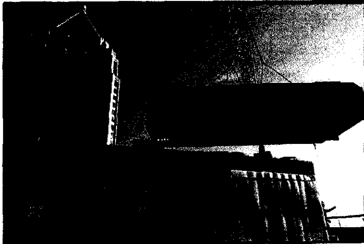
Brackin Building Two Rebel DPS Packaged Units