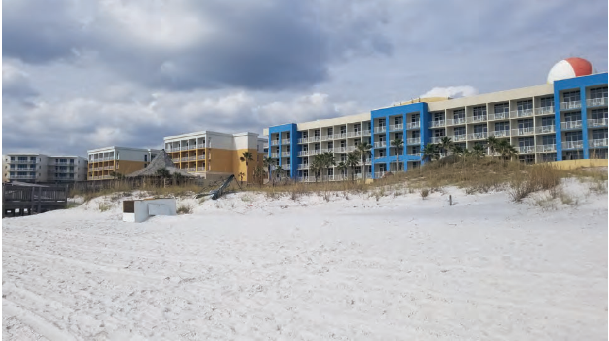
Photo 9. Beachfront near hotel facing northwest. (November 4 th , 2021)