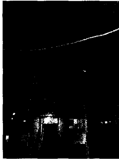
Heads in kitchen 3