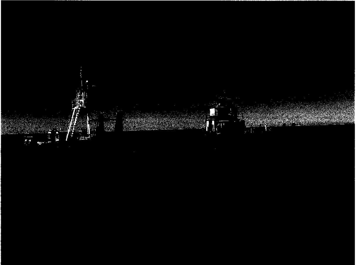
Figure 3: Okaloosa County Contractor Morgan Marine using a water pump to fill the M/V MISS JOANN with water. Three pumps were used and no additional holes were cut at the water line.