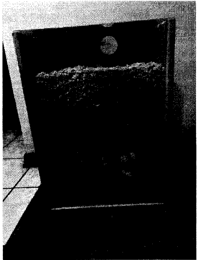
Proposed educational box: